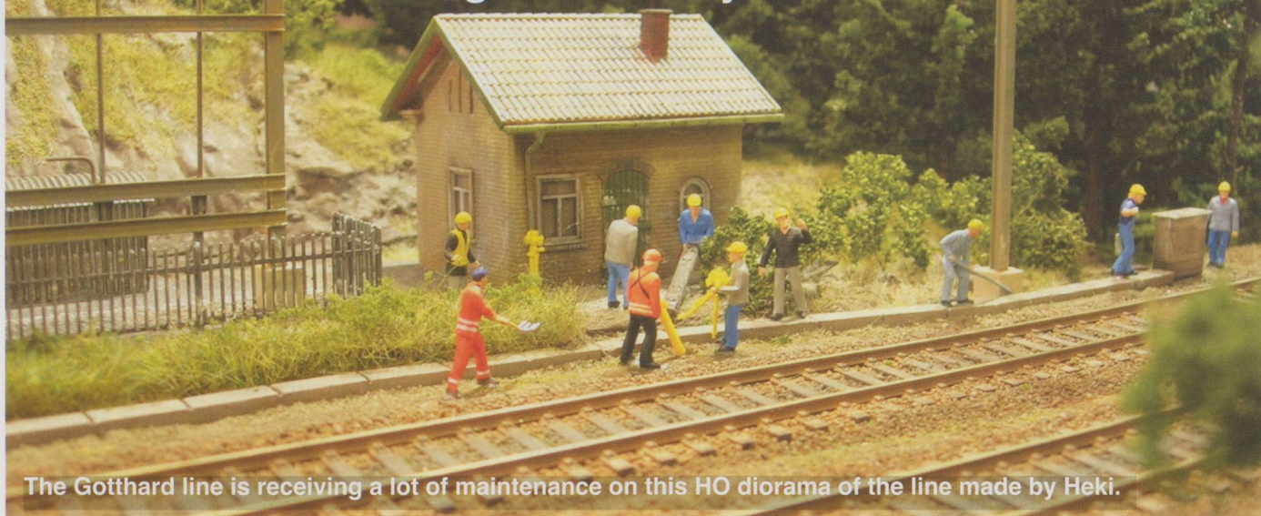
The Gotthard line is receiving a lot of maintenance on this HO diorama of the line made by Heki.

The number and variety of accessories that are now available for model railways in all of the popular scales is enormous. There are detailing parts in plastic, in resin, in white metal and other materials. Some come ready assembled and painted, others arrive in unpainted form or as a kit. New products are being introduced constantly.