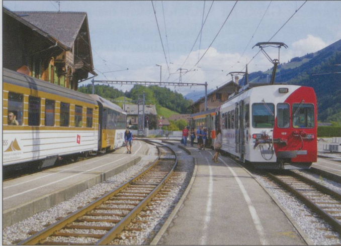
Changing trains at Montbovon on 7.9.2013.