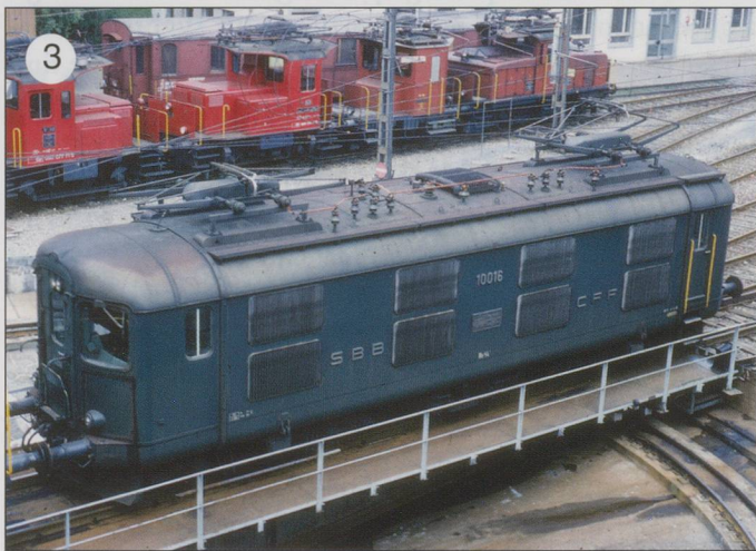
1. Re4/4II 11243 at Thun on a working to Interlaken on 28 January 1989. 2. Re6/6 11688 Linthal approaching Brunnen on a Chiasso – Schafhausen working on 6 September 1989. At this point the southbound track is in tunnel while the northbound one uses the original single track. 3. Re4/4I 10016 on the former turntable at Luzern shed. Note the 'blank' bodyside on the non-corridor side of the locomotive.

that the twin axle bogies can follow the track more easily and the transfer of weight between axles is reduced, thus maintaining better contact with the rail. This is important when exerting a high tractive effort. The smaller bogie has a naturally lower resistance to being rotated either laterally or in pitching, thereby reducing the dynamic forces applied to the track 5 . The centre bogie can move laterally. Four prototypes appeared in 1972 to test the mechanical layouts, the body of the first two being made in two sections connected by a horizontal hinge. The purpose of the hinge being horizontal was to assist the locomotive in following vertical curvature. Experience showed that the simpler construction using a single body was adequate and this was followed in the production series introduced in 1975. The class is effectively an Re4/4II stretched by 50%, since it uses the same bogies, wheelsets and traction motors and can work in multiple with the Re4/4II and Re4/4III. The advantage over the Ae6/6 is indicated by the higher hourly rated power output of 7,850kW, compared with 4,300kW, for virtually the same tractive effort. This enables a higher speed to be reached before the maximum tractive effort can no longer be sustained.