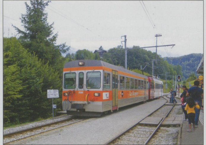
TPF No. 226 at Gruyères on 7.9.2013.