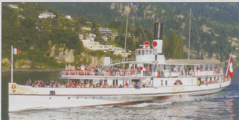
100 years old and so young - PS Gallia , fastest steamboat in Switzerland!

For a lot of Swiss the Italian Lago di Como, and its namesake town, are considered to be almost a part of their country. Indeed Como almost considers itself Swiss. In a recent unofficial referendum carried out by a local newspaper, a large majority of the town's citizens suggested that they would like the