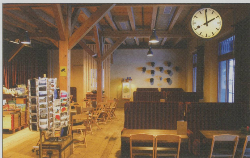
TOP: RhB's ticket office. BOTTOM: the café and shop.