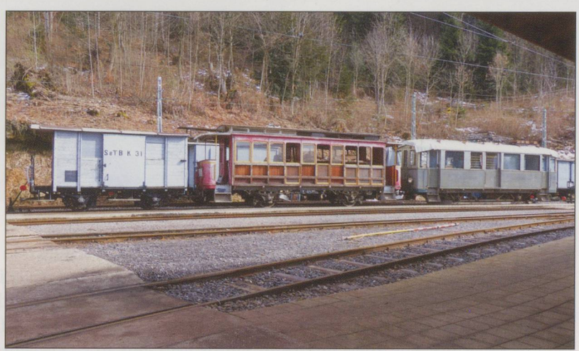
TOP: The first step of the current shed renewal with the rather awful Eternit cladding replaced by a much better suited wood front. Expensive, but a real improvement to the whole area. In front of it some long running "work in progress", the Sernftalbahn set, which is next in line for refurbishment.

BELOW: Another view of the Sernftalbahn set.