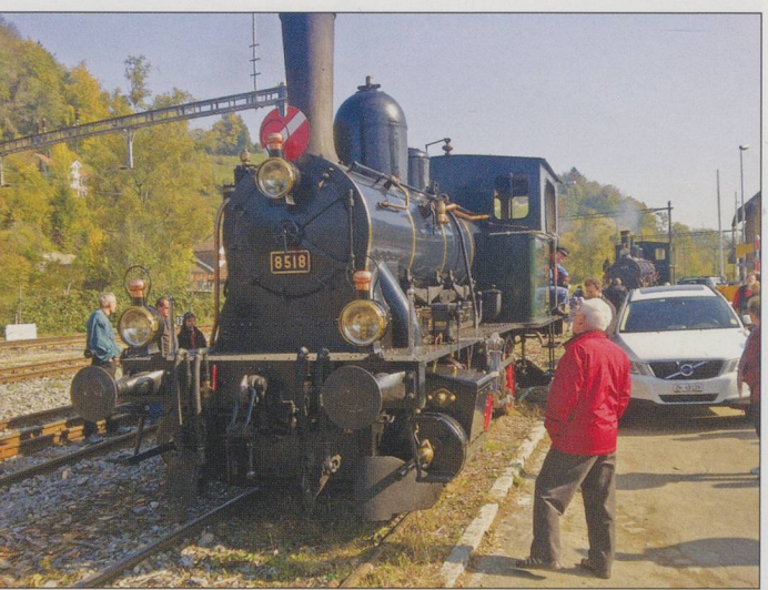
Ex SBB E3/3 No.8518 at Bauma.

As could be implied from the name, it is a showcase for specialist manufacturers of Swiss model railway products. It is usually held around the second or third weekend in October, from Friday to Sunday in the Swiss village of Bauma between Winterthur and Zürich. There some 60 manufacturers of Swiss model railway products, buildings and accessories attend. With the exception of Bemo, who always put on a big presentation and usually have an RhB narrow gauge model railway on display, most of the others are tiny one or two man businesses dotted all over Switzerland, Austria and Germany. The chances are that you won't even have heard of at least half of them! In these days of Chinese mass production the only way high cost countries, like Switzerland, can compete is with very specialist products in small runs (hence the name), that are often hand crafted. Of course there is a drawback. If you want to switch from window-shopping to serious buying I advise a very large chequebook or credit card limit... However, it is often possible to buy bits and pieces for your layout that you will never find in England for very reasonable sums, and that will add hugely to the atmosphere. There is a certain thrill to having items on your layout that no one else has ever seen and at Kleinserie there never seem to be any other English voices to be heard.