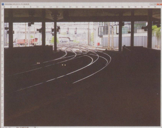
As taken, the camera has tried its best, but the shadows are blocked out and the exterior is too light