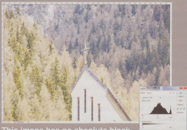
This image has no absolute black or white - the histogram doesn't reach either end