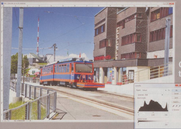
Correct exposure - the histogram is evenly spread