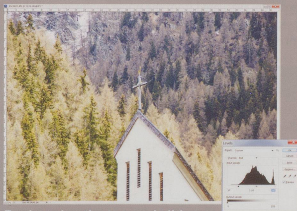
By dragging the two end sliders towards the centre, the image has more depth of colour