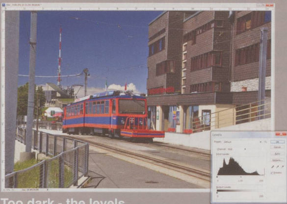
Too dark - the levels histogram is concentrated towards the left hand side