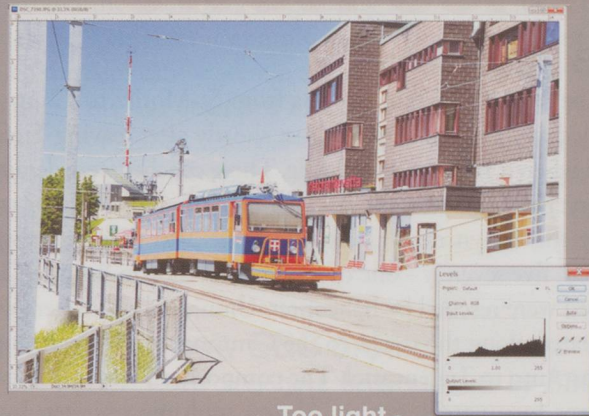
Too light - now the levels histogram is concentrated towards the right hand side