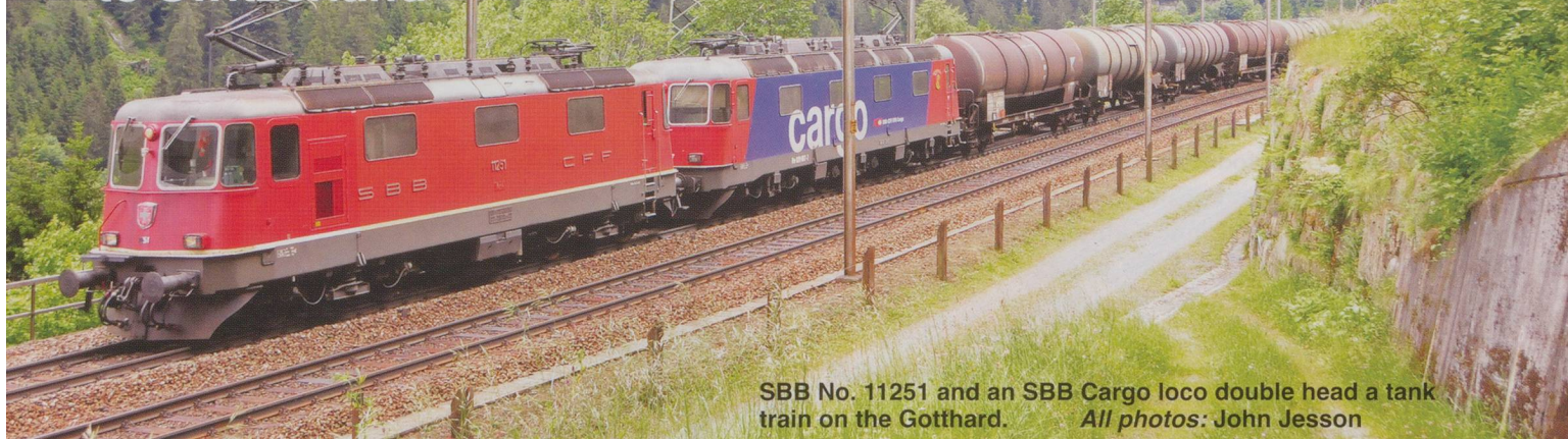
SBB No. 11251 and an SBB Cargo loco double head a tank train on the Gotthard.