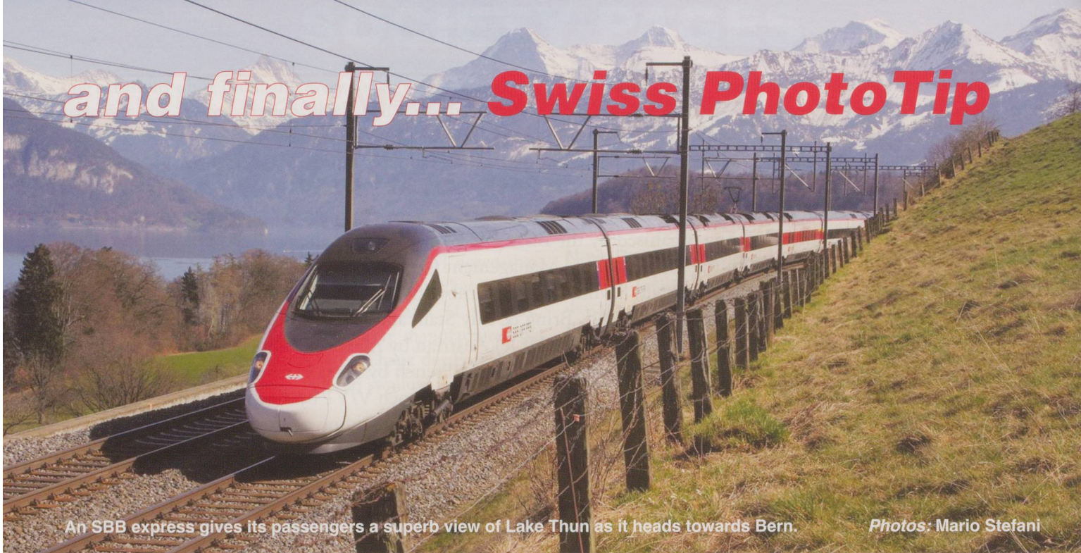
An SBB express gives its passengers a superb view of Lake Thun as it heads towards Bern.