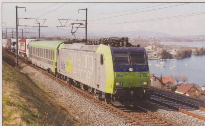
BLS Re 485-012-9 hauls a train of lorries south from Thun.