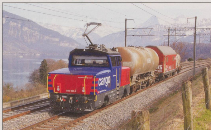
Cargo loco 923-020-2 hauls a short train towards Thun.