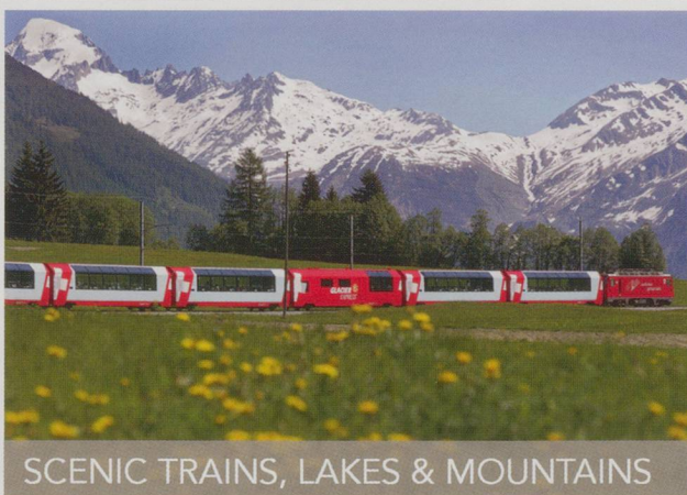
SCENIC TRAINS, LAKES & MOUNTAINS