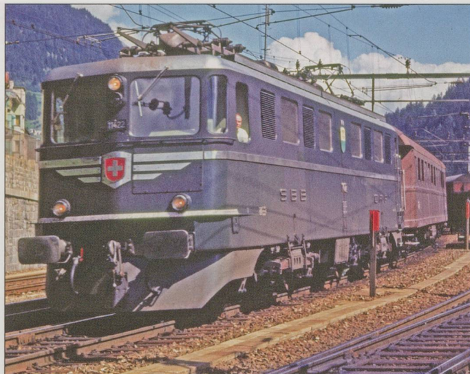
ABOVE: No.11422 'Vaud', at the head of an express from Italy, curves into the Gotthard tunnel at Airolo in the summer of 1967.

BELOW: A northbound freight has arrived at Airolo and is about to detach the Ae 6/6 which has been the assisting loco on the climb from Bellinzona.