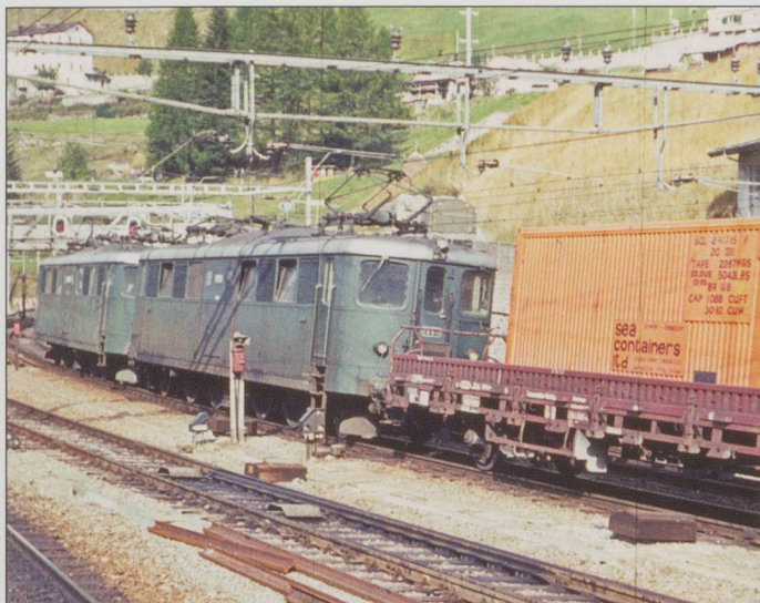
ABOVE: After detaching the assisting loco, the freight goes forward with its pair of Ae 4/6 locos, Nos.10808 + 10811, according to my notes of the time.

BELOW: No.11410 'Basel Stadt' on a northbound International express on the Middle Meienreuss bridge, with Wassen church behind.