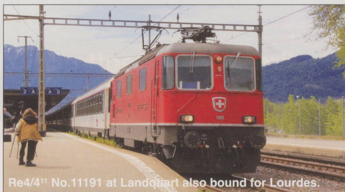
Re4/4 11 No.11191 at Landquart also bound for Lourdes.

What may seem an unlikely subject for Swiss Express is in fact still a substantial business for Swiss railways. Lourdes, in the Pyrenees, is the location of a Grotto, which is, for many devout Roman Catholics in the hope of healing, a greatly revered place of pilgrimage. It is served by the SNCF, and especially in the period from Easter to Whitsuntide, is visited by many thousands from all parts of Europe. Considerable organization is required, since distances are long, many pilgrims are elderly and invalids, and special facilities are needed. A programme of special trains is run, mostly as charters by private organizations. Switzerland sees trains from Germany, typically via Basel/Genève and St Margarethen/Zürich, and there are also charters from Catholic regions of Switzerland. Rolling stock is increasingly provided by private operators, including couchette cars and a number of adapted cars for wheel chairs and for the bed-ridden. The SNCF still has, it appears, a considerable fleet, marked by a purple strip above the window line. There still exist some ambulance cars from earlier military and civil defence requirements. Some 470 voluntary helpers are involved, some to accompany the trains supplying refreshments and care.