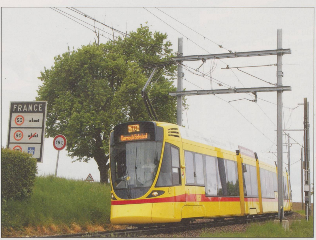
BLT Be6/10 No.157 leaving France as it approaches Flüh. France in May 1940 changed things abruptly. On June 3rd 1940 the French ordered the BTB to stop running through Leimen. A PostAuto was instituted, over the hill between Rodersdorf and Flüh. On June 22nd the BTB started again, but the Alsace population was already in flight; indeed, some local Swiss farmers tried, despite the closed frontier, to care for livestock left behind. The German military occupation was in place by July 1st and from then on no further informal actions were possible. The German Army units along the frontier were reinforced by SS Officers, with a barracks in St Louis just outside Basel. Some cross-border contact was necessary, but was strictly supervised. The BTB

Then came WWII. After the first alarm and Swiss mobilisation in 1939, nothing at first happened. However, the German invasion of Belgium, Holland and BLT Be6/10 No.164 at Flüh. The green hill behind the Swiss building is France and was enemy territory in both wars.