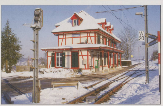
TOP: Leymen Station and Custom House. The freight customs shed was accessed from Switzerland by the double doors and exited to France at the other side of the building. ABOVE: Leymen station building is preserved but it is now unmanned.

operated, though without a stop in Leimen, as there was no civil authority, only liberation forces, and no customs facility. This came in July 1945, as remnants of the civil population slowly came back.