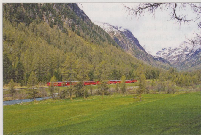
An RhB train proceeds up the vally to Spinas.

i.e. uphill. However, a word of warning, if you are going to stop and photograph trains then remember the estimated times shown on the fingerboards will be considerably extended!