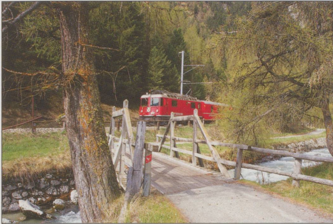
RhB 4 4 II No. 619 between Spinass and Bever.

Muragl and taking the funicular up to Muottas Muragl for refreshment and to enjoy the view.