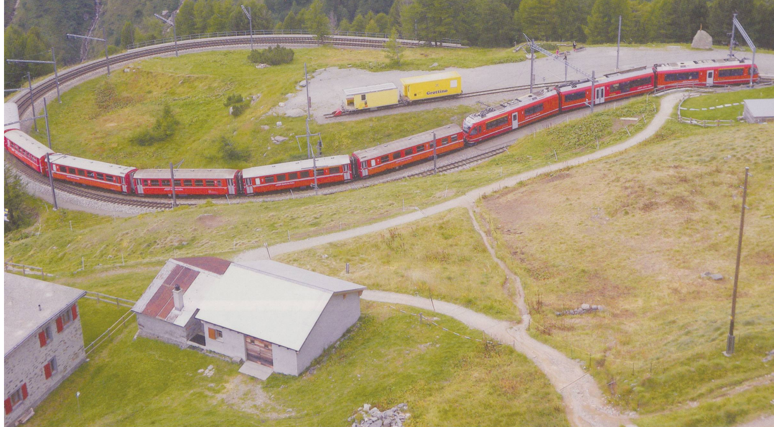
An Allegra unit leads a train into Alp Grum on 08.09.14.