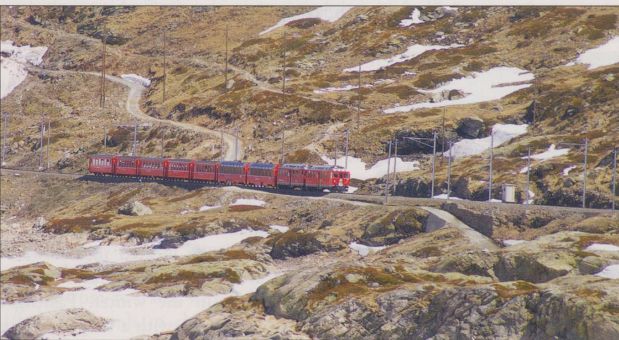
Leaving Ospizio the path follows the railway.

Ospizio Bernina to Alp Grum. Level for much of the way, with a slight incline beyond the end of Lago Bianco. Steep drop down to Alp Grum station at the very end. Cafes at both Ospizio Bernina and Alp Grum stations (run by the same person!). Also, the restaurant situated high above the station has a terrace with a good view of the horseshoe curve below.