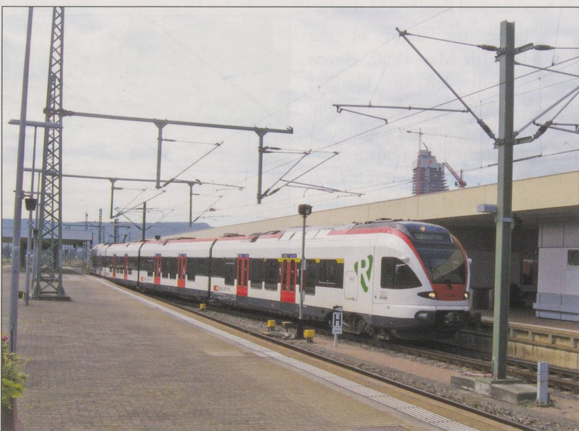
TOP: Z-T No.105 at the Blonay Chamby. Photo: Bryan Stone MIDDLE: 1925 built ex-SEG, Mallet type, 0-6-6-0T Compound at the Blonay Chamby railway. Photo: Bryan Stone BOTTOM: A SBB FLIRT enters Basel Bad Bhf from the Wiesental line.