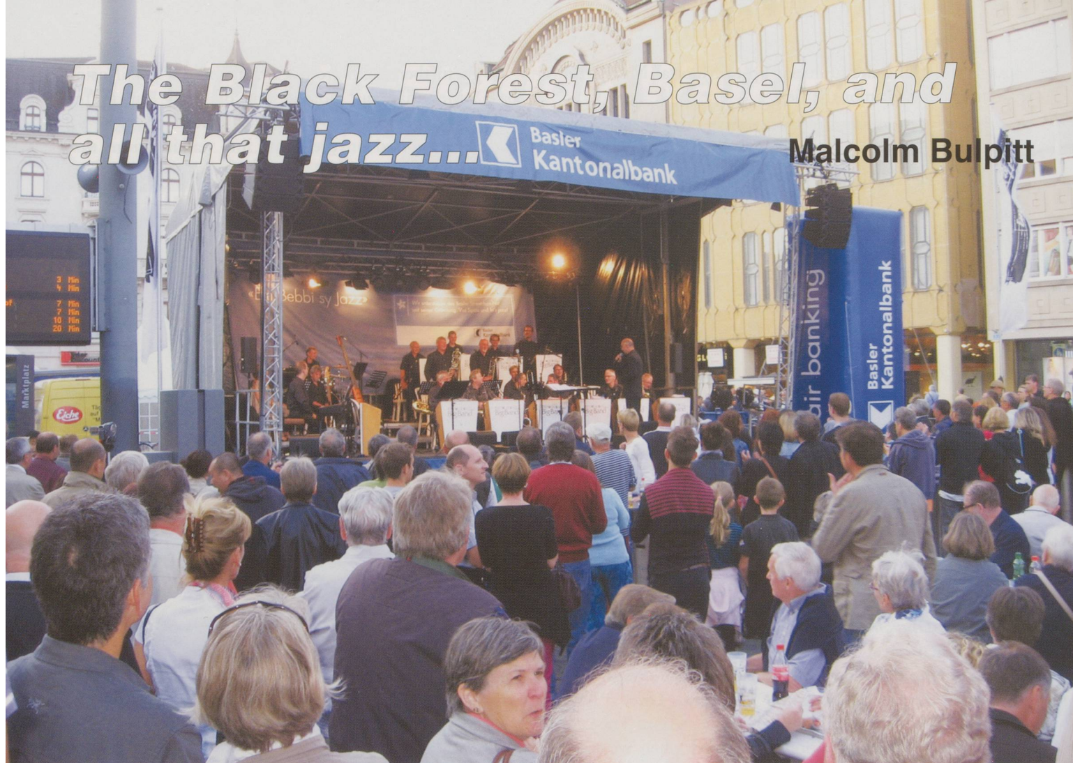
The Big Band in the Marktplatz - with the trams still operating to the last.

Famously Basel sits at the junction of Switzerland, France and Germany and it is the wooded hills of the Black Forest that form the northern boundary of this tri-nation agglomeration. There is a lot of necessary co-operation in this area between administrations, and as an example it is the SBB that run many of the local rail services in the German suburbs and beyond. The principal SBB operated route follows the Wiesental north from Lörrach, through busy Schopfheim to the undistinguished