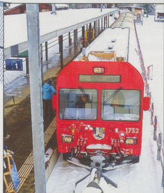
The arrival of a sledge train at platform 1 in Bergün-Bravuogn.

Every winter the 6km of winding road that runs down from Preda to Bergün is closed to traffic during the day and becomes one of the longest publically accessible sledge runs in Europe – and it's floodlit six nights a week! Key to the operation of the run is the shuttle-service of trains between the two stations provided by the Rhätische Bahn. If people have not brought their own sledges, toboggans, etc. they can be hired (from CHF12/day) in Bergün, where all the participants make their way to the station. Here they load their equipment onto to the Schlittelzug, a special