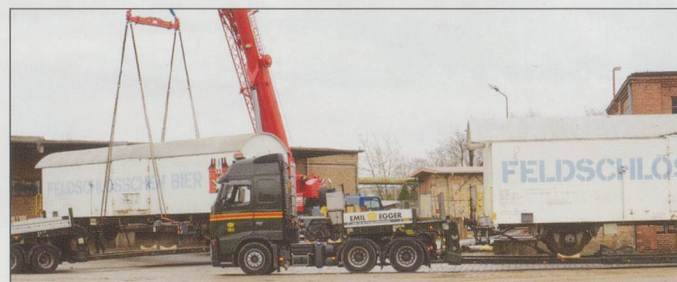
The wagons are unloaded from their road transport.

company offered them free to the museum, but without the DB authorisation they had to be transported by road to Switzerland. Raising funds for the project and planning the exercise took some 6 months, but eventually on the 11th February last the two box vans were repatriated to their former home country and delivered back to their builder, Meyer in Rheinfelden. The company no longer builds wagons, but will restore these two. In the end there was one snag occurring on the whole trip. At the Swiss frontier the customs agents held them back, together with their road transport, for a whole day because they could not believe that the two wagons were a free gift to the museum! ☝