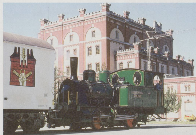
The brewery E2/2 working in the 70s.