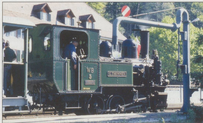
ABOVE: WB No 5 at Bad Bubendorf. BELOW: WB train in 1/11/1970 before the line was closed.