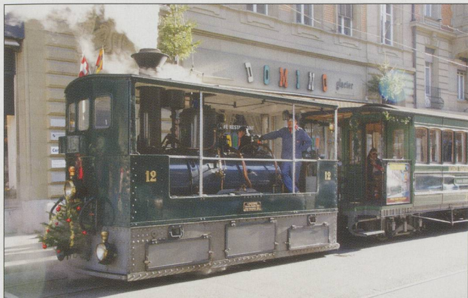
Above, steam tram No.12 in Bern and below the driver's eye view of the controls and the road ahead.

1950 as reserve on the Stansstad – Engelberg railway. In 1902 No.12 went to a sawmill in Biel, and from 1943 it was stored for an SBB museum. It was then exhibited at Technorama in Winterthur and it also ran from 1971 to 1983 on the Blonay-Chamby Museum Railway before returning to Bern.