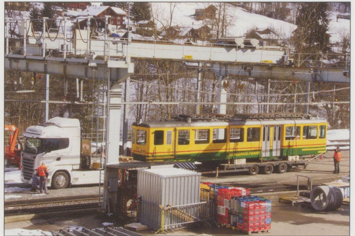
WAB 119 on low loader at Lauterbrunnen

At Lauterbrunnen on 5th March WAB BDhe 4/4 No.119, stripped of useful bits, was loaded onto a truck for its last journey - to the scrapyard. Nos.101, 107, 109, 119 and 124 are also taking this road, whilst No.102 was scrapped last year. No.109 was still in action at the station, but reprieves are short.