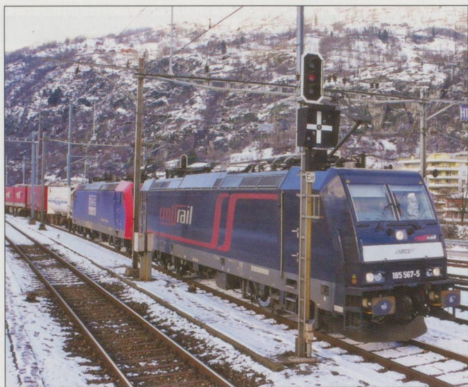
Double header Crossrail train.

A majority shareholding in Crossrail of 50.1% has been bought by German organisation Rhenus AG. Crossrail, with headquarters at MuttENZ (Basel) marshalling yard, operates a frequent service of container trains mostly over the BLS route, including some which take the old line through Kandersteg. Their locomotives are a familiar sight on trains, and in Brig, Spiez and Thun for banking and double heading. Crossrail has recently opened an operations centre in Brig, from which out-and-back workings to Basel and Milano/Novara are possible, and has some 60 drivers based there.