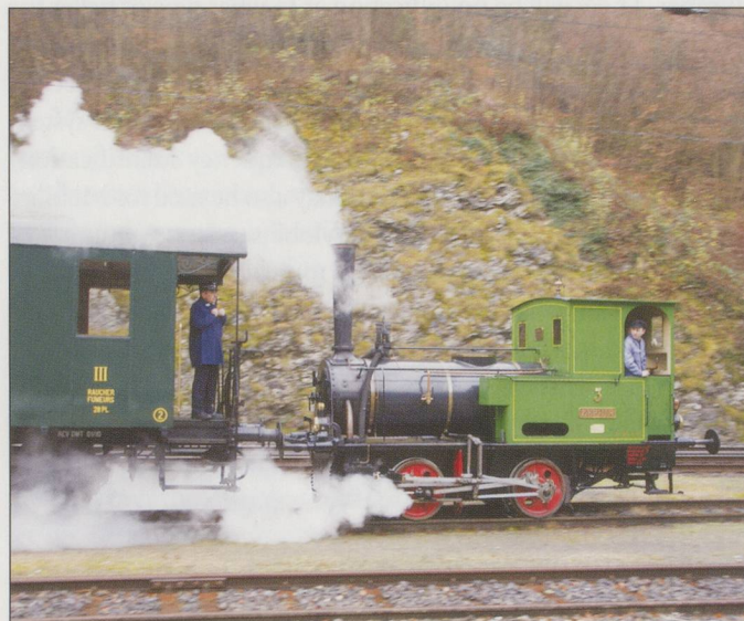
Locomotive 'Zephir' at Choind z station. (2)

Over the past winter SBB Historic has moved its archive and offices from Bern to Brugg. This move is planned to be celebrated in Brugg, together with 'Bahnpark Brugg', on 31st May when a programme of special trains will operate through the day with Eb 3/5 No.5819 from Brugg station. Also this year two more trips are planned using 1874-built E 2/2 'Zephir', a survivor of the B delibahn the first railway in Interlaken. These will be on 26th Sept. and 10th Oct. in conjunction with a conducted tour of the Del mont roundhouse of SBB Historic and Historische Eisenbahn Gesellschaft, and a return trip to Choind z for a visit to the Von Roll museum of the one-time ironworks located there. Your correspondent enjoyed a similar trip behind 'Zephir' last December.