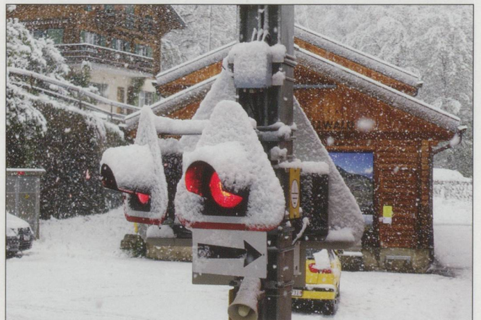
ABOVE: Is the train on-time? Who knows?