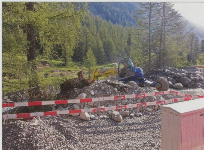
Preparation work for the new Albula tunnel at Spinass.

Arosa and back before completing the loop via Landquart, Klosters and Davos.