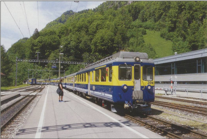
The next train arrives at Zwiöltschinen ready to split and panic the tourists.

Day 4 saw us on the Rigi via Spiez, Interlaken, the Zentralbahn, ship from Luzern to Vitznau and the Rigibahnen. Back down via the Weggis cablecar (both train up and cable car free on a Pass) to a crowded Luzern and then train to Bern, 5 minutes late in and 10 minutes late out. At Spiez the second Re460 in two days failed so all out and into the next service to Brig.