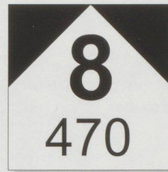
A representation of the gradient board at Mühlelen. The line is shown to rise at 8‰ for 470 m.