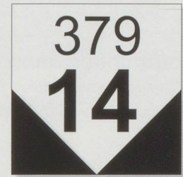
A representation of the gradient board at Le Brassus station. The line falls at 14‰ for 379 m.