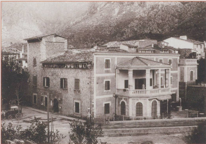
Soller station front. The house as was, but changed to become the station with the booking office, etc. inside.