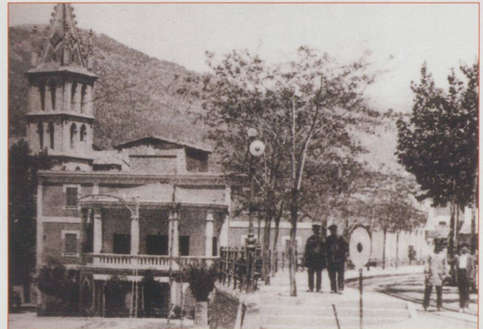
Soller station platform. Back of the house now the station with one platform. The veranda is now a cafe.

First off the mark to challenge this was Geoffrey Bryson who noted that his 1993 edition of The Guinness Book of Railway Facts and Feats , listed Cuautla, south of Mexico City, as having the world's oldest railway station. The Mexican station was originally built as a convent in 1657 until it was secularized in 1812, then becoming a station when the railway was opened in 1860. In its original use the building was catering for the needs of New World Catholic women for 33 years, before Old World Swiss Catholic men could go to Grafenort on holiday! It also had seen 38 years of use as a station before the LSE's predecessor the Stans Engelberg Bahn opened its facility in the Herrenhaus in 1898.