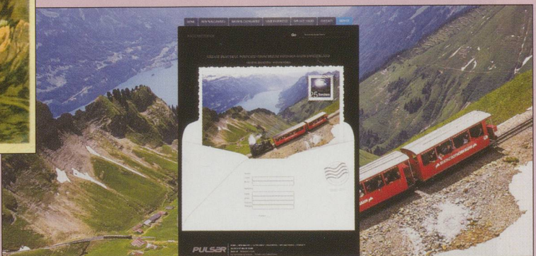
RIGHT: Modern e-card - courtesy www.ecardmedia.eu.