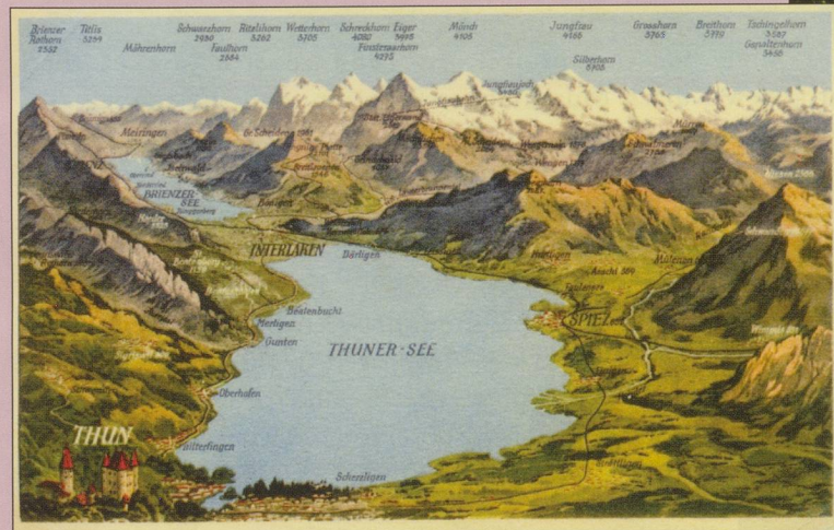
ABOVE: An aerial depiction of Lake Thun that also shows the old tramway route on the northern (LH in this view) side of the lake.