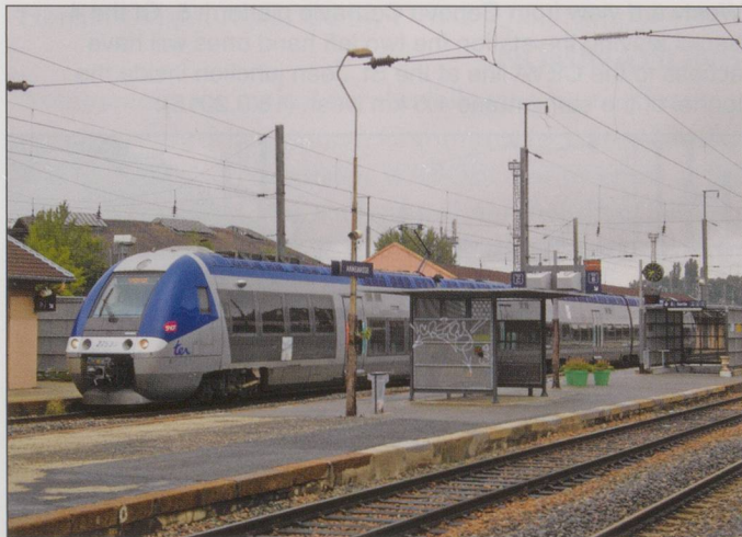
SNCF TER unit at Annemasse Station. This will be much busier once the line is opened in 2019. A new island platform will be built to the left of the picture with switchable overhead power (15/25 kV). (19.9.2015)