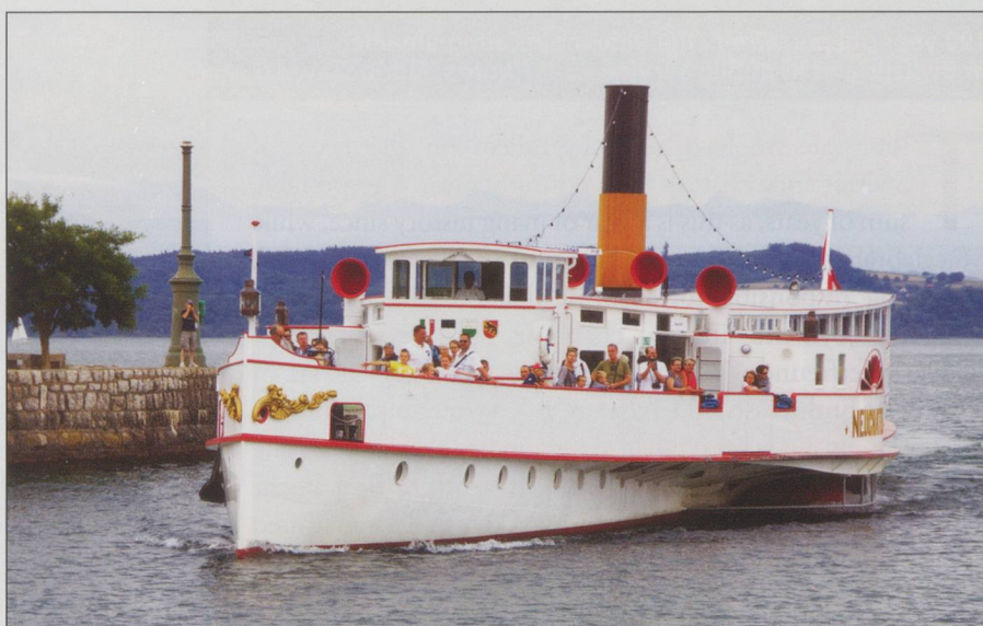
'Neuchâtel' arriving at Neuchâtel.