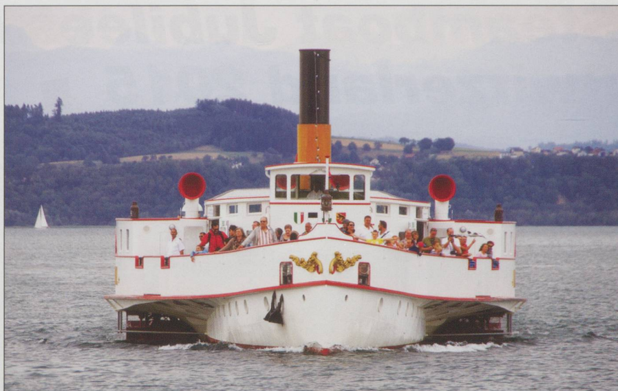
'Neuchâtel' approaching her home port.

Back to our paddle-steamer: the 'Neuchâtel' has retractable upper works which are required for bridge clearance in the Zihl Canal, allowing her to navigate on all three lakes. On a recent cruise we travelled from Neuchâtel, leaving at 12.05, to Murten and back, a deeply satisfying 3 hours of hissing and puffing with that gentle to-and-fro sensation which all our paddle-steamers generate. The passage of the Broye Canal takes about 20 minutes, partly through a wild-life sanctuary in the reedbeds, and the view from the lake of the historic walled city of Murten (scene of the Confederation's victory