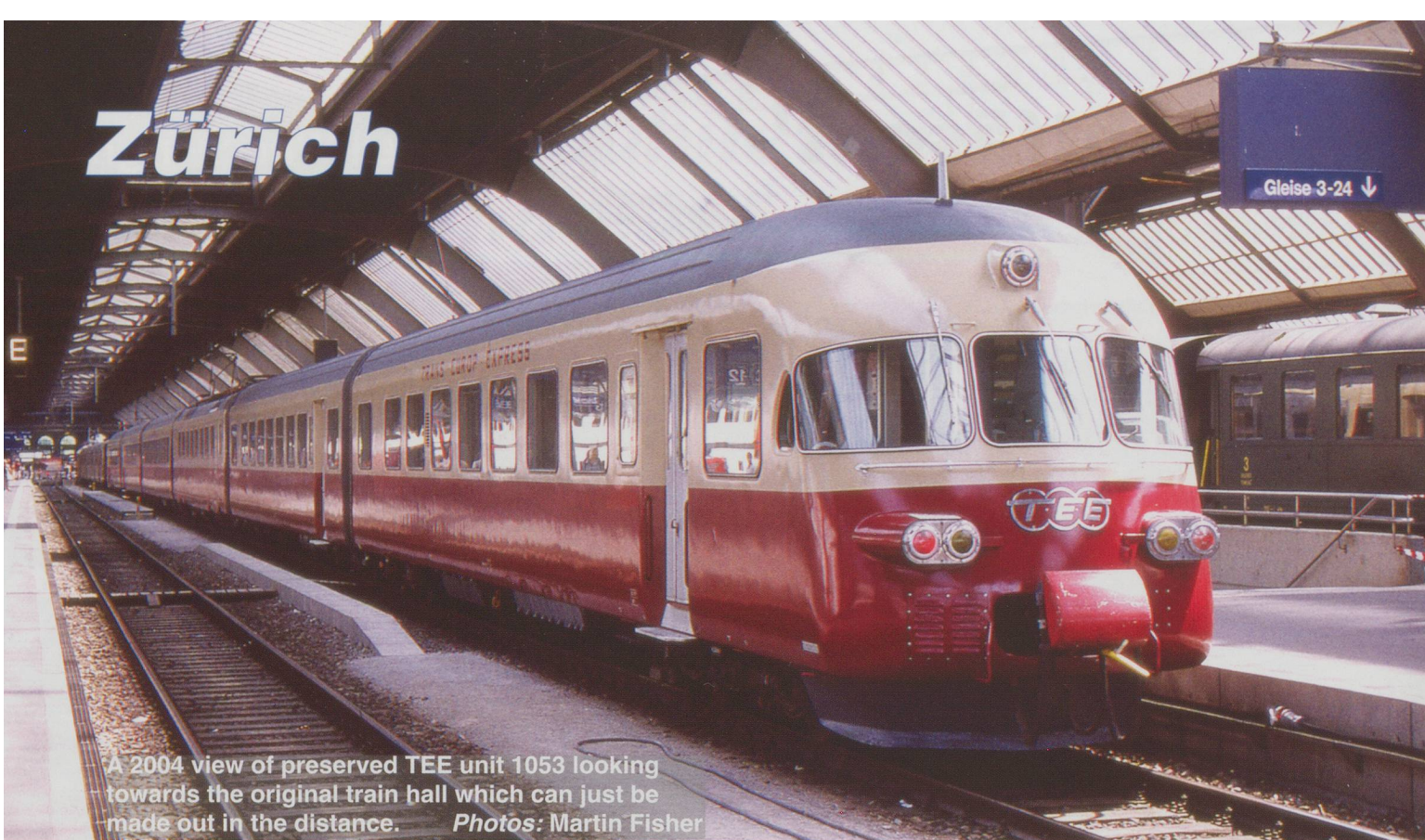
A 2004 view of preserved TEE unit 1053 looking towards the original train hall which can just be made out in the distance.