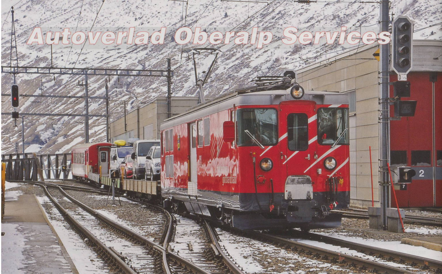
MGB Class Deh 4/4 No. 22 'St Niklaus' had just left the Autoverlad terminal at Andermatt.