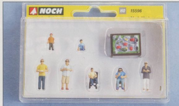
Railway modellers by Noch!

Noch is well known for producing a large range of figures for modellers in all of the popular scales but these two packs are a little different. One is a set of railway modellers and the other is of Swiss station personnel, one of whom carries an illuminated train despatch disc. There are seven railway modelling figures including two children. Four of the figures are wearing glasses and three of them are holding controllers.