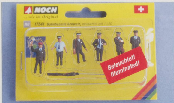
Swiss station personnel by Noch.