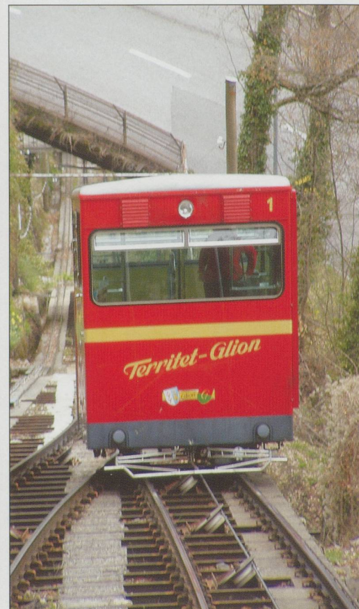
ABOVE: An original car is preserved at the lower terminus. RIGHT: Territet-Glion at the half way passing point.