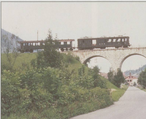
ABOVE: Crémines, SMB 1971, open doors and lots of parcels.