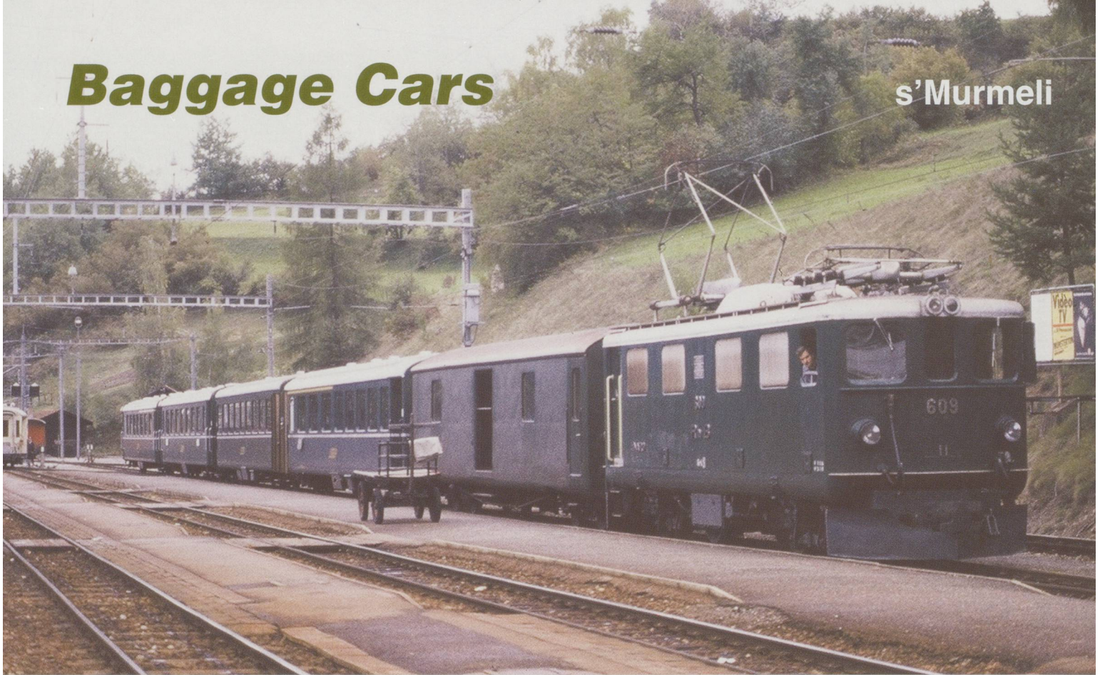
Filisur RhB Davos train with open door and typical station barrow.