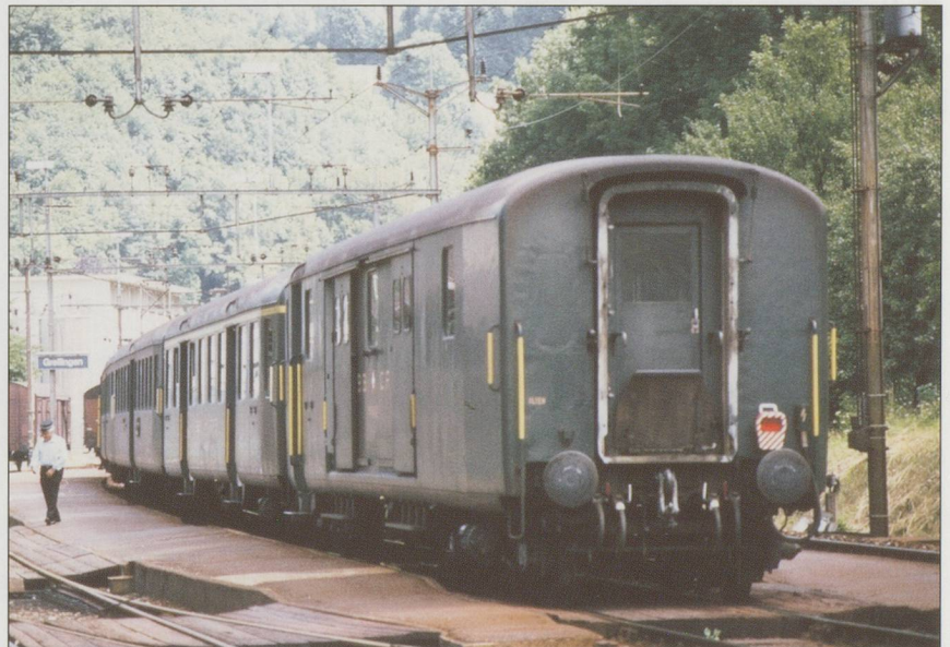
LEFT: SBB, Grellingen, 1998, Delémont – Basel local, classic EW 1 baggage car (also with open door!).