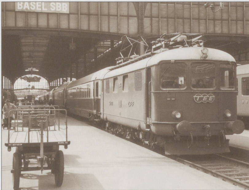
SBB TEE Rheingold 1965 when it went to Genève. Note the Station barrows and left, a porter.