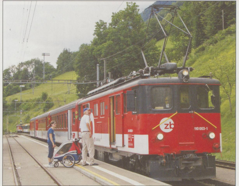
Zentralbahn, Oberried, 2013, using a redundant baggage compartment to help a passenger with a bike and trailer.