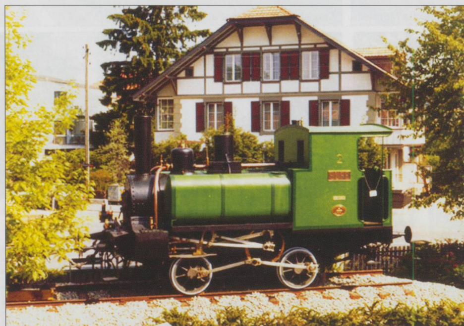
TOP: Disused industrial sidings.