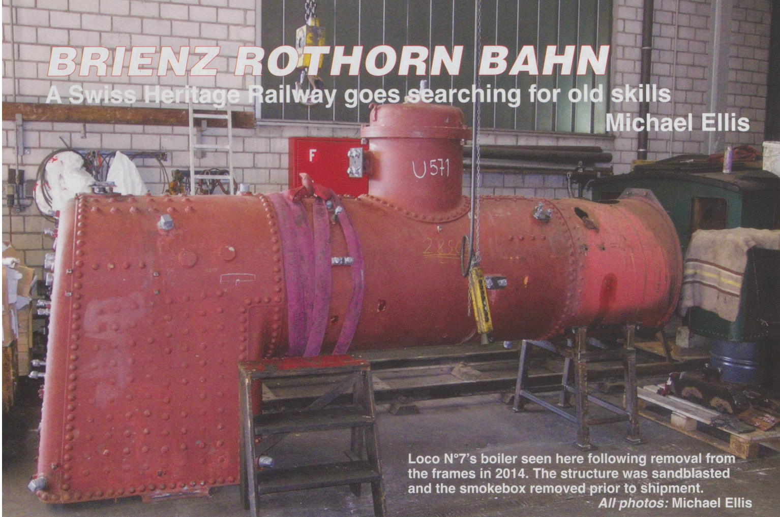
Loco N°7's boiler seen here following removal from the frames in 2014. The structure was sandblasted and the smokebox removed prior to shipment.