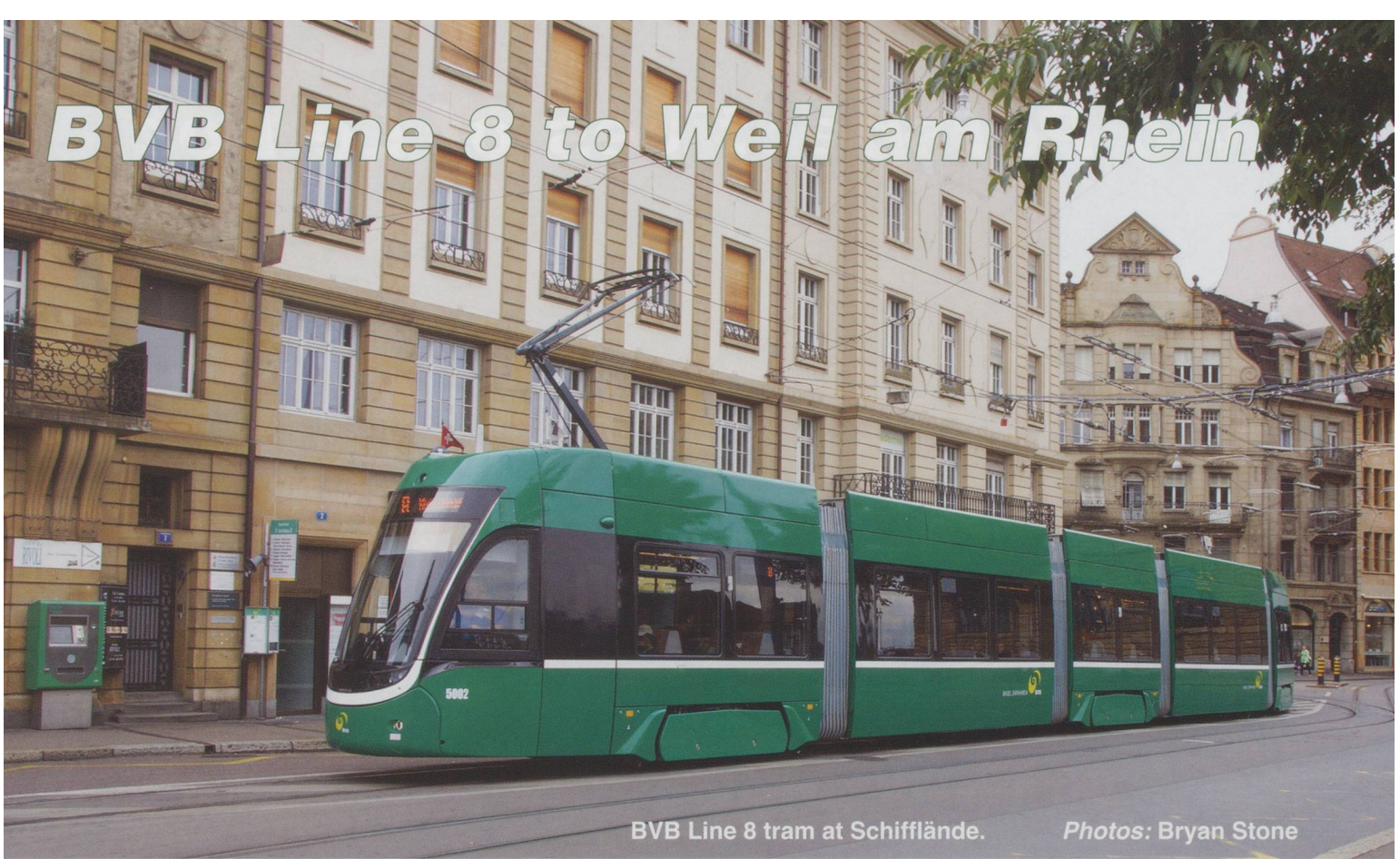
BVB Line 8 tram at Schiffflände.