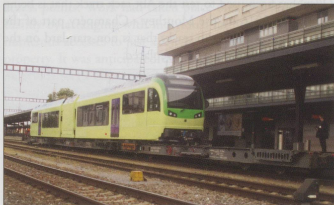
New TPC unit at Frauenfeld, 18.05.2016.