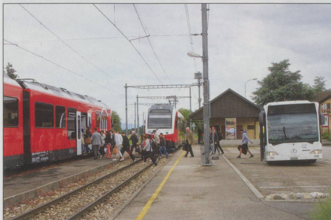
Nyon St Cergue temporary closure, changing from bus to train and laying new track.

The Colline viaduct by Genolier is due for renewal, resulting in this metre-gauge line being closed until mid October between Trelex and Givrine with a substitute bus service in place.