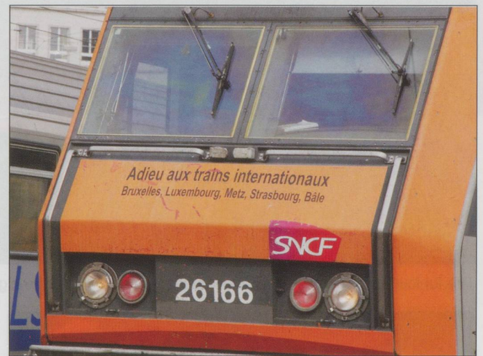
SNCF BB 26166 EC 96 IRIS BASEL BRUXELLES Dernier EC Voyageur Basel SNCF 02-04-2016.