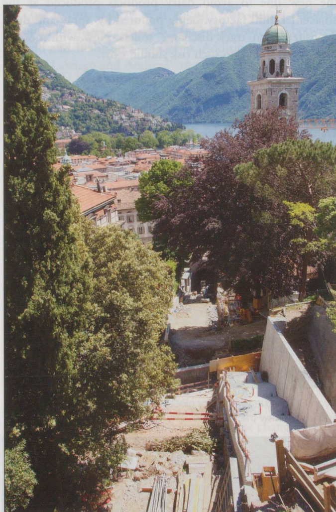
A view over Lugano with work in progress on the funicular.

the line. However the walk up and down through the old town, and past the cathedral, although strenuous, is a delight. A replacement shuttle bus service has been provided using a circuitous route.