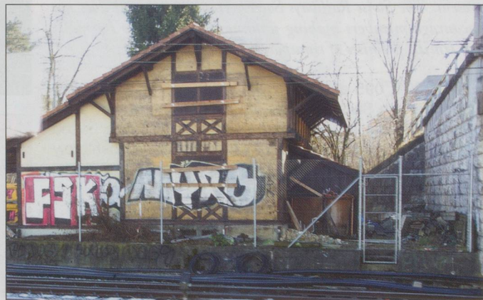
Wylerfeld SCB Haus, Bern, 27.12.2015.

Swiss Express is good at being the first, but this time we were the last. The reference on P7 of the June magazine, at the end of the Bern/Ostermündigen article, to a SCB Section House of 1857 at Wylerfeld is no longer valid, as the building was demolished (it didn't need much) during April, as part of the widening works now in progress. A picture of the house just beforehand is attached. There are others; look out on the east side of the line north of Sissach to see one from 1855 in good condition.