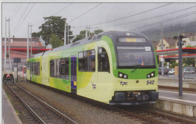
New TPC (AOMC) rack-fitted Stadler GTW 542.

The TPC, in the middle of a major renewal programme, bade an official farewell to its old stock at an open day on Sunday 19th June, timed to coincide with the local cycling and cultural event la Fugue Chablaisienne . Special free shuttles ran between Aigle and En Châlex Depot and were shared between new Stadler unit No.542 and 1954 Schindler/BBC rack-and-adhesion car BDeh 4/4 No.514 (originally No.14). In addition travel was free between Aigle and Monthey, with all trains serving the staff platform at En Châlex. During the morning, ex-BirsigtalBahn (BTB) car Be4/4 No.102 plus driving trailer was on the 'free-for-the-day' service. In the afternoon it was replaced by 1986-built Vevey set BDeh 4/4 Nos.501/531. The ex BTB cars have what may be the last seating on any stock in Switzerland which retains 1960s style leatherette seating with red covers for smoking and green for non smoking. At Monthey there is an interloper to be seen on occasion. BVB BDeh 4/4 No.82 'Ollon' has been used to test the Abt rack track that is being laid during 2016 on the Monthey - Champéry part of the AOMC line as the Strub track, that is non-standard on the rest of the TPC operations, is replaced.