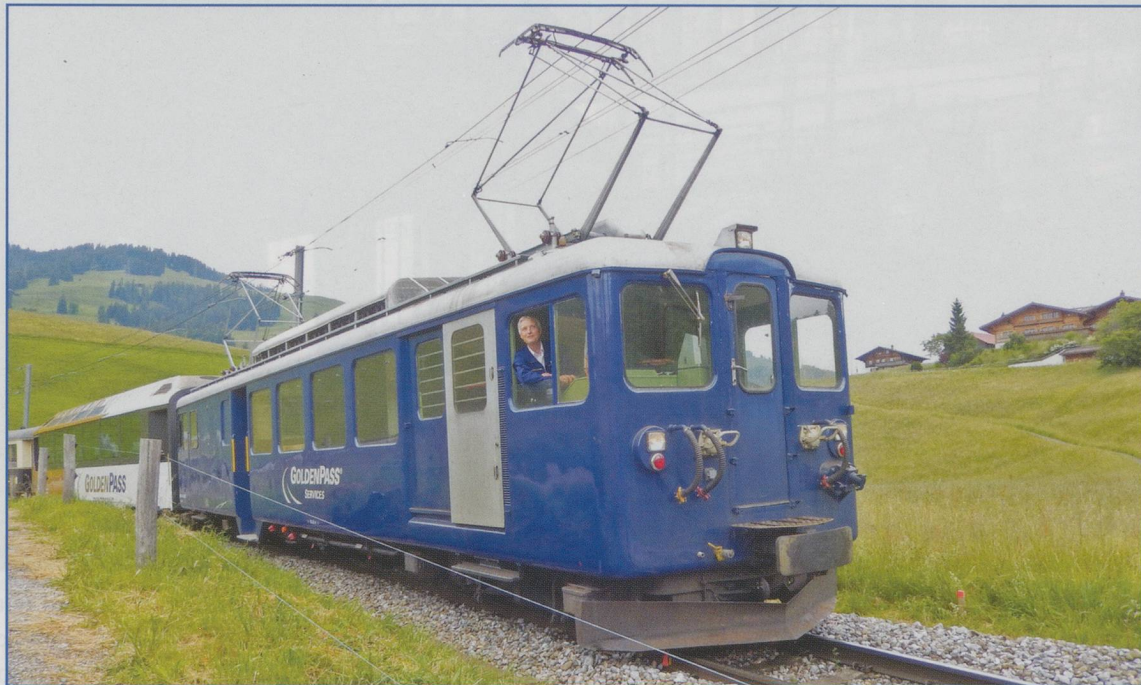
Beat Feller on an MOB special.

“These men are what we are dreaming of: Engine drivers in the Swiss mountains.”