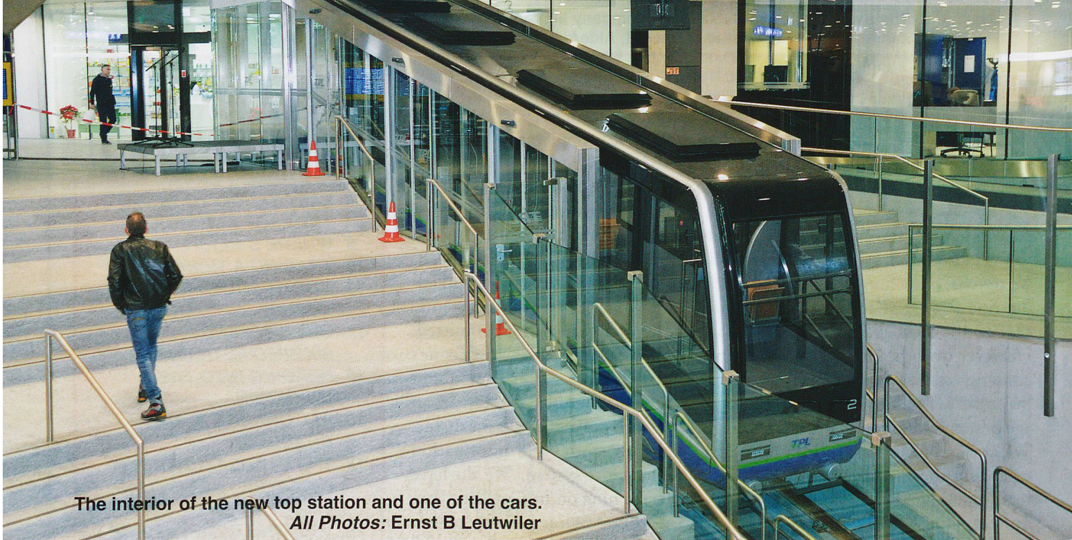
The interior of the new top station and one of the cars.

When the main line railway from the north to Italy via the Gotthard tunnel, arrived at Lugano in 1882 the site of the station was 53m above the old town leaving residents and visitors to this increasingly popular resort, with an arduous route between the two areas. Increasingly pressure mounted from influential people who determined that a more commodious link should be established. At the end of 1884 the well-known pioneers of mountain railways Bucher & Durrer obtained a concession to construct a 220m long, metre-gauge funicular on a gradient of 25.3% to link the city to its station. Once the project commenced in April 1886 progress was swift, and following an inspection in the October operations started on