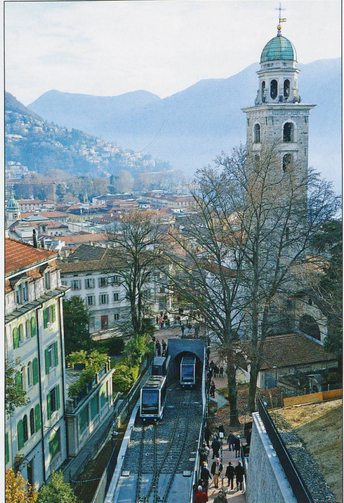
TOP: Crowds at the top station for the opening of the new funicular. MIDDLE: The view looking over Lugano. LEFT: Work in progress on the middle cross-over section. BOTTOM: The interior of one of the new cars.