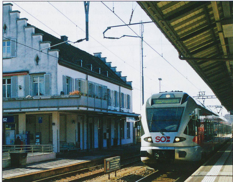
BOTTOM: SOB 526 051 stops at Pfäffikon.

TOP: A suburban 511 set at Basel. MIDDLE: A modern BLS 485 017 heads a train of new cars through Weil