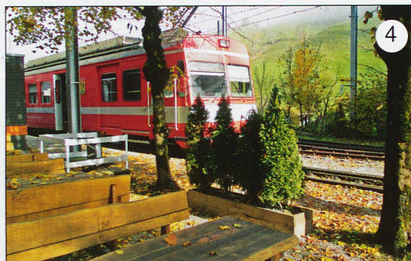
1. BDeh/4 No 14 with all over advert enters Appenzell from St Gallen Jan 2017.