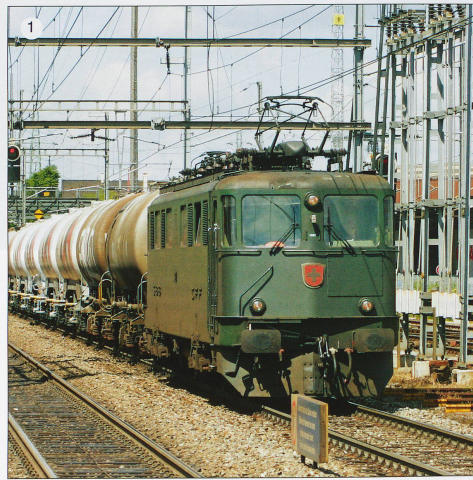
1. No.11427 'Stadt Bern' leads a train of cement tanks out of Basel Muttentz yard, 27/06/08. 2. No.11465 'Oerlikon' approaches Killwangen-Spreitenbach with a mixed goods bound for Zurich Limmatthal yard, 25/06/10.

3. 610482 'Delemont' returns to Erstfeld, light engine, prior to taking up her next duties, 18/09/09. 4. No.11407 'Aargau' heads a Schaffhausen - Chiasso charter through Erstfeld. Classmate No.11402 "Uri" can just be seen in the far distance, 03/09/11. 5. No.11431 'Sarnen' stands at the end of a row of no less than 21 class Ae 6/6s at Biasca - all of which were bound for the cutter's torch, 22/06/10. 6. Cantonlok No.11404 'Luzern' passes through Pratteln on the Brugg lines with a mixed freight, 27/06/08. 7. Immaculate 610439 in Cargo livery complete with 'Schaffhausen' nameplates, hauls a northbound container service through Pratteln, 27/06/08.