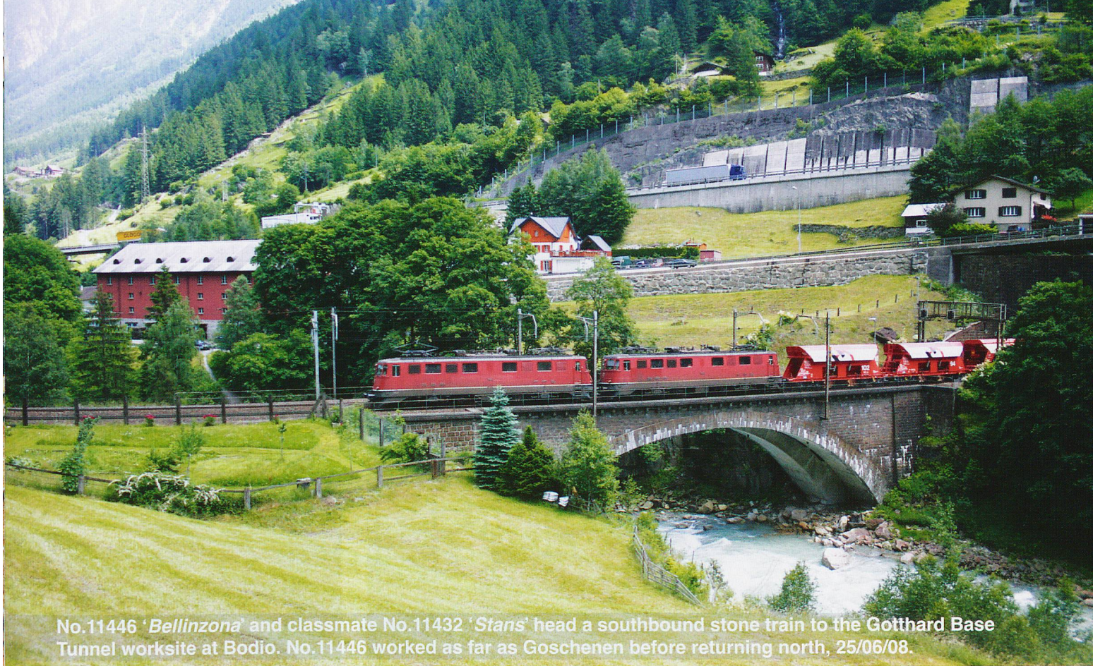
No.11446 'Bellinzona' and classmate No.11432 'Stars' head a southbound stone train to the Gotthard Base Tunnel worksite at Bodio. No.11446 worked as far as Goschenen before returning north, 25/06/08.

to be the destination of choice for many years to come. Scheduled workings for the Ae 6/6 class over the mountain route were very rare indeed, however in the summer of 2008, the construction works associated with the Gotthard Base Tunnel did produce a regular Ae 6/6 working, this being a double-headed combination working a stone train from Huntwangen-Wil to Bodio. Such workings still exist today, being in the hands of an 'Re 10/10' combination and serving the Ceneri Tunnel worksite.