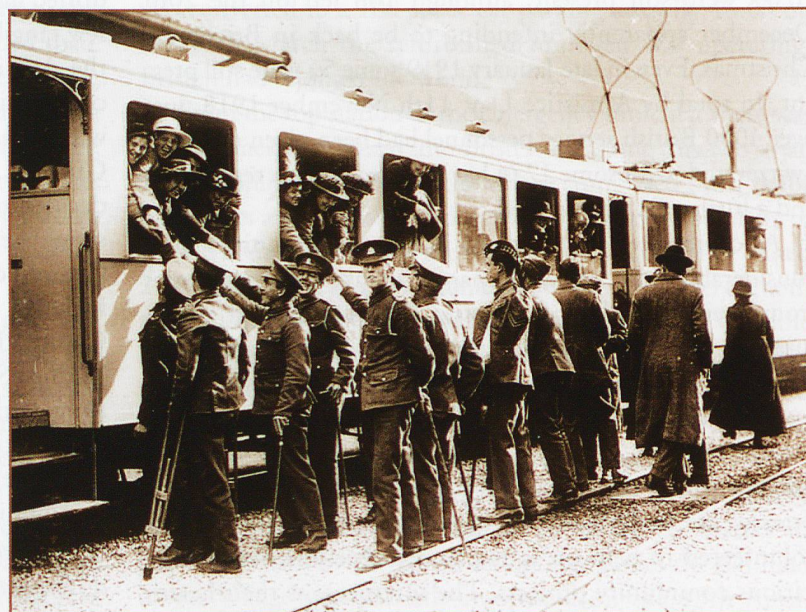
TOP: British POWs disembarking at Chateaux D'Oex in 1916.