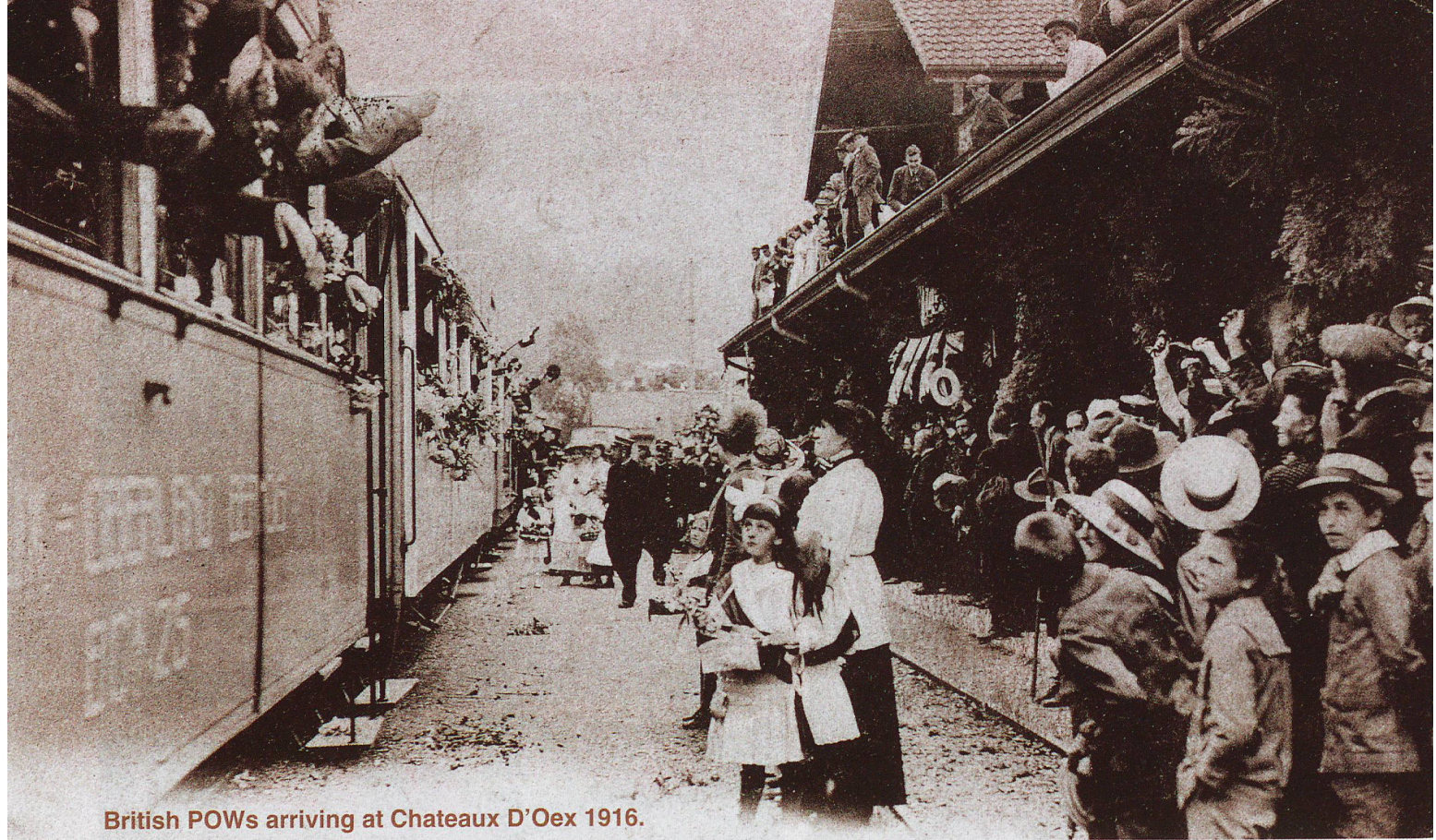
British POWs arriving at Chateaux D'Oex 1916.