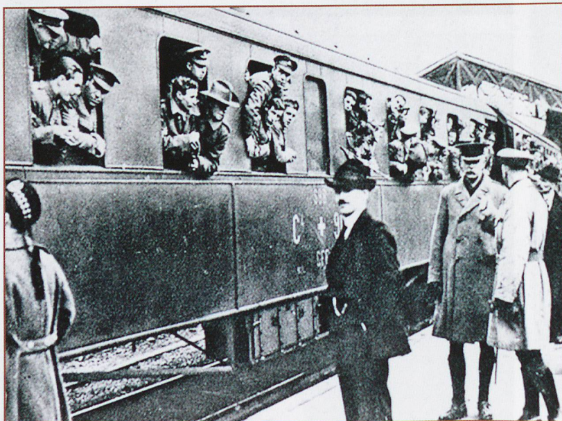
British POWs en-route through Switzerland in 1916.

It was in the late spring of 1916 that the Government of neutral Switzerland agreed to take into their country numbers of injured and sick British troops who were being held in Prisoner-of-War camps in Germany. By this stage of the war the German medical authorities were struggling to cope with the increasing numbers of their own injured servicemen being repatriated from the front, so passing some enemy casualties on to the Swiss was a practical, as well as a humanitarian, move. The Swiss Government invited communities to come forward with plans, availability of accommodation, and the ability and willingness to take on the role of hosting these men. The first to do so was Chateau d'Œx, shortly followed by Leysin and Murren. In many small alpine resorts hotels had stood empty following the exodus of tourists after the start of hostilities in 1914. Also, as the PoW's national governments had agreed to fund the accommodation, this was seen as a boost to these local economies. In the long term it was considered that most hotels, etc. made little, if any, profit from this exercise. However, their use in this manner probably saved many from closure, whilst offering employment to local people. In many of these resorts there were also small resident communities of ex-pat British who were on-hand to help with any of the potential issues