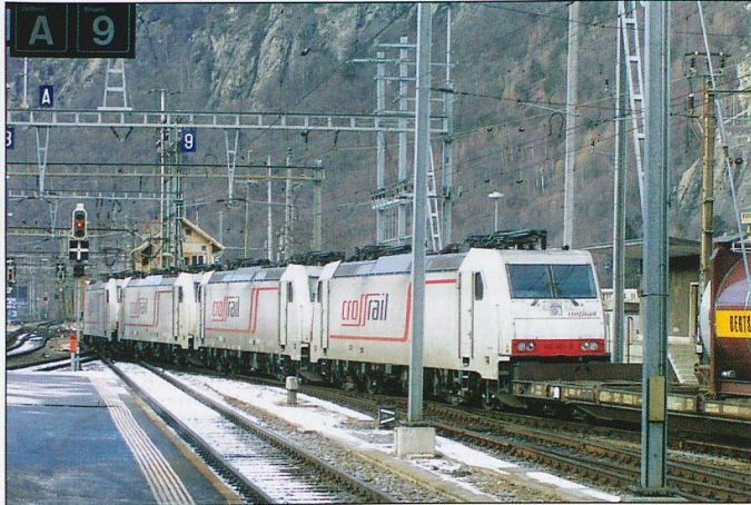
185 580 (Crossrail) and 3 more at Brig. Crossrail used the old Lötschberg line for many trains.

a large part from Switzerland. The locomotives, personnel, and operations, were in February being managed by SBB Cargo (probably on an interim basis), including the extensive banking for DB trains which have used the old Lötschberg line through Kandersteg. Reports suggest that the five Re 430 locomotives will be sold to Widmer Rail Services. The majority shareholder in CrossRail is the German logistics and Rhein shipping organisation the Rhenus Group, which is making no comment.