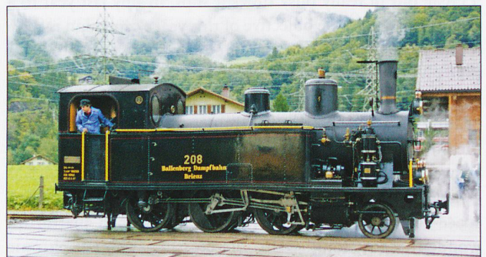
G3/4 208 Ballenberg now back in Service this summer after fire damage and rebuilding.