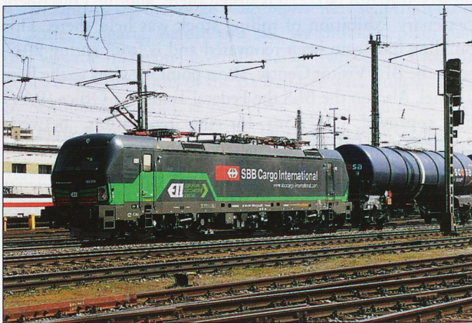
One of the new hirings, 193 259, on a Swiss fuel tank train.

● SBB Cargo International. New 'Vectron' locomotives on order for north-south transit traffic and will be certified for Germany, Austria, Italy and for Switzerland. The locomotives will be ordered by, and leased for 15 years from, a new company, Locrail Holding. This was formed in 2016 by Reichmuth Infrastruktur Schweiz AG, itself a holding of the private bank Reichmuth in Luzern. SBB Cargo International will act as technical partner for ordering, acceptance trials and general rail management.