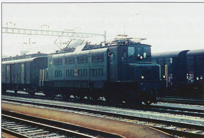
Ae3/6 10601 prototype of this standard class, when still running in Delémont in 1969.

In the last 15 years the contribution paid by SBB to SBB Historic has reduced by CHF500,000 at a time of increasing costs, and a requirement from SBB's Estates Department for SBB Historic to pay market rents for the numerous premises it occupies. Also the costs of equipping working museum pieces with modern technology to allow main line operation is taking its toll on restricted finances. All this means is that SBB Historic is investigating ways to save money and to cut-down on overheads. One idea that has come under criticism from various groups associated with the organisation's conservation programme is to put some 10 of its lesser-used 'working' fleet of 38 locos/EMUs into 'cold' storage. Taken aback by adverse comments from some of the volunteers who spend time keeping the collection in working order, it has now decided to review the decision.