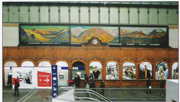
The magnificent concourse of Basel SBB station.