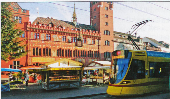
The market stalls in Marktplatz.