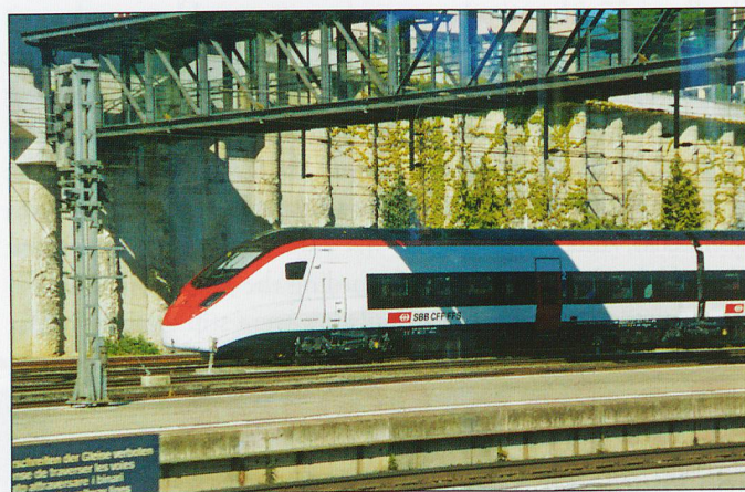
501 001 - the new Stadler HST at Spiez.

Swiss operator BLS has also ordered 58 new single-deck train sets from Stadler. These are 6-car units based on the FLIRT platform for delivery between 2021 and 2026, planned for Regional Express services (30 units) and for the Bern S-Bahn (28 units). At CHF650m it is the biggest rolling stock order ever placed by the BLS. In addition, options were signed for a further 82 units in various configurations. The RE sets are for the lines Bern-Neuchâtel-La Chaux de Fonds, Bern-Kandersteg-Brig/Zweisimmen, and a new service Bern-Konolfingen-Thun. On entering service the new equipment will enable the withdrawal of 43 older trains from the EW III, RBDe 565 and RBDe 566 fleets, with the first arrivals of the new units scheduled for 2021.