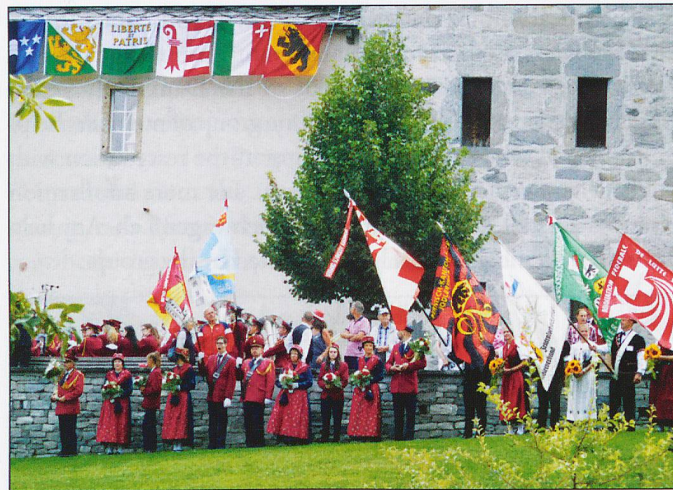
Brig Yodeler Festival.

This Swiss News feature was compiled at the end of June. However in July, whilst we were still putting the magazine together, news came through from Switzerland that SBB had