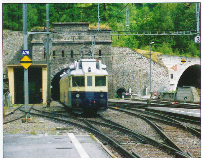
Vintage BLS Blue Arrow enters the old Lötschberg tunnel at Goppenstein.

excavated but left without technical installations; and a further 7km of tunnel has still to be bored. Advanced work on this now essential project, is well advanced and in June the Federal administration approved the next part of the process by granting 'Planning Credits' to the project.