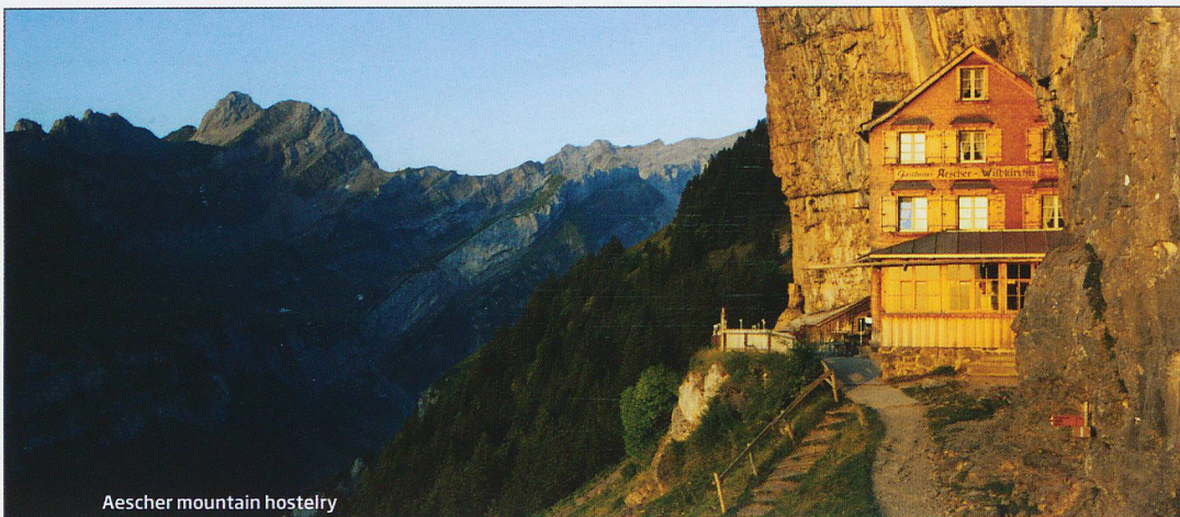
Aescher mountain hostelry