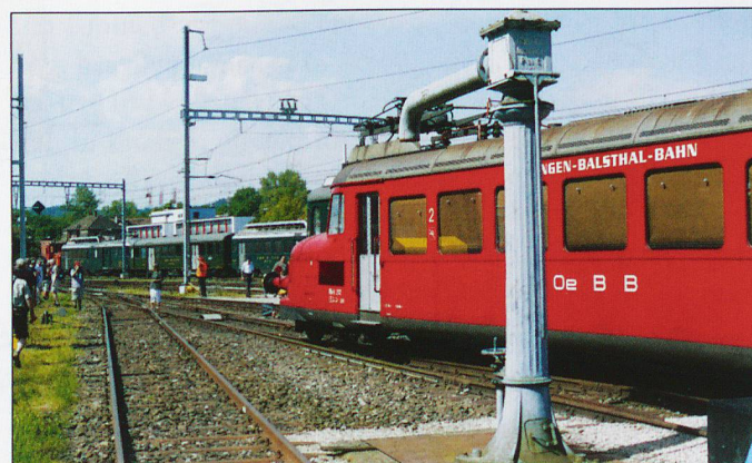
TOP: Verein Tunnel-Kino ex-SOB ABe4/4 No.11 (from 1939) at Laufenburg.