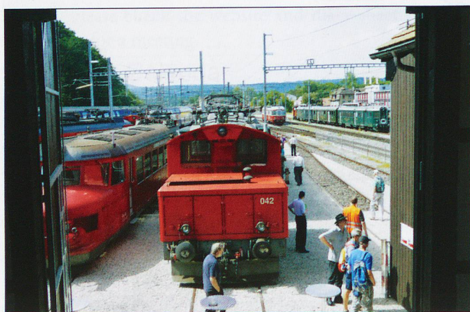
LEFT: A general view of the Koblenz railcar gathering from the DSF-restaurant in the Depot.