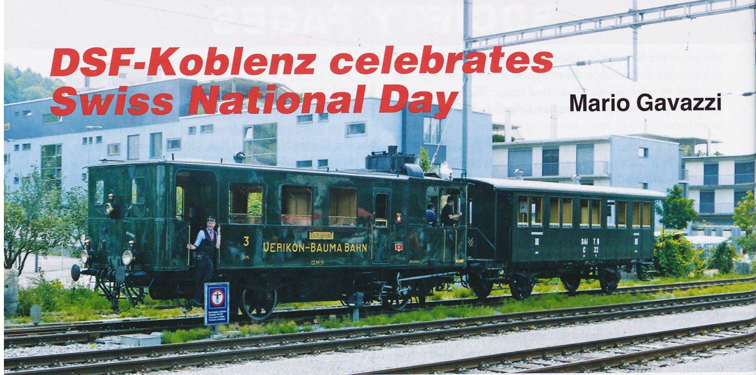
UeBB steam railcar CZm1/2 No.11 (from 1902), plus coach C 22, at Laufenburg.