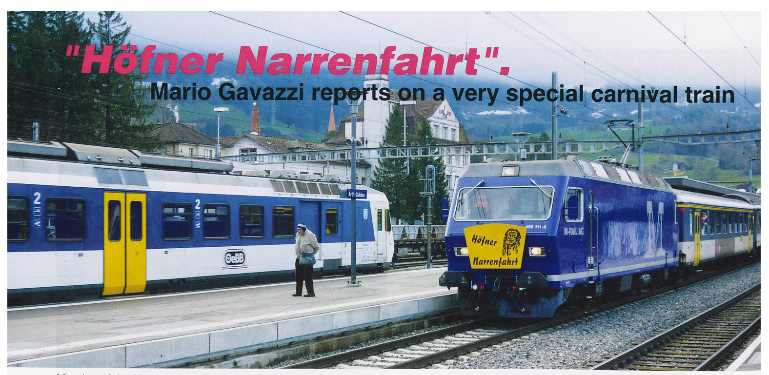
Meeting of the Narrenfahrt at Arth-Goldau with SOB-Voralpen-Express, operated by 'special guest' NPZ-RBDe 207 from Oensingen-Balsthal-Bahn.

o you know what carnival is? Of course you have heard of it. Very well known is the carnival in Venezia, or in Germany those at Mainz, Köln, München, etc., or the Rio de Janeiro one. Many regions in Switzerland also know this tradition. In the catholic Cantons the carnival season generally begins in January and, depending on the calendar, ends in February on the Dienstag (Tuesday) before "Aschermittwoch" - Shrove Tuesday and Ash Wednesday in Britain. It is then that carnival begins in several protestant Cantons like Basel Stadt or Schaffhausen. Carnival is a happening normally confined to individual towns and villages, but there is one important exception for people who love trains. The carnival committee of Wollerau, located on the Zürichsee in the Höfe district of Canton Schwyz between Samstagern and Pfäffikon, organises the start of the celebrations with a special train - the "Höfner Narrenfahrt" - Höfner Fools Ride! This is organised by SOB and the carnival committee, and from year to year its composition changes with usually a mix of SBB and SOB coaches. This year the composition was very colourful! Some ex-SBB-Bpm51 coaches (refitted as Bm), one NPZ-A, and two ex-SNCF luggage coaches, acquired years ago by the SBB to carry cycles. These were used as "Bar Coaches", whilst the train was hauled by Re 456 111-4 of M-Rail AG.