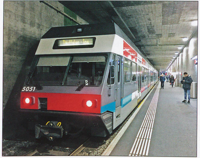
An Ins train arriving at Biel.

In pleasant sunshine we explored the walls and the old town before enjoying an excellent lunch. The weather then closed in so we returned to the comfort of the trains. Back to Ins and onto the Aare Seeland AG metre gauge to Biel. This passes the company's very modern and quite extensive depot at Tauffelen and ends in a dreadfully bleak concrete bunker beneath Biel station. We dashed through the busy main station onto a train towards Delle. Finding it did not stop at Tavannes (as planned) we rode to Glovelier. This rural junction may be charming on a warm summer's day but with a cold biting wind in March it has little to offer. There was an excellent tearoom, but with little time to enjoy the ambience we chose some portable patisserie for our onward journey.