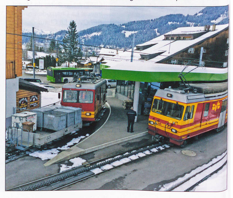
Looking down on Villars Station as the 'goods train' departs.