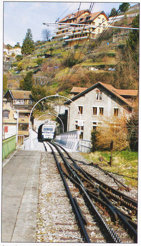
A train approaching Les Planches the disused loop in the foreground.

the Rochers de Naye, (1,970m) joining the train as it emerges from a steep tunnel at Les Planches, the first halt. A cheerful young driver shook hands as he welcomed us onboard to join the two other passengers workers at the terminal building. "Did we really want to go to the very top?" To my response "Of course" he just grinned. After Caux there was much more snow and by Jaman (1,742m) we caught up with the snowplough! Unfortunately in the murk, plus the clouds of powdered snow it sent up, it was impossible to get a decent photo!