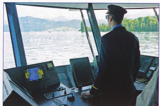
RIGHT: ms Bürgenstock is operated using modern navigation systems.