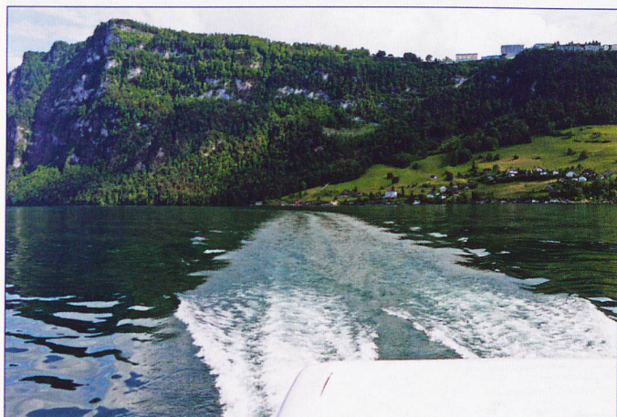
LEFT: ms Bürgenstock speeds from Kehsiten on the inauguration trip.

Following the 2017 completion of the CHF1billion refurbishment of the hotels and associated developments at the Bürgenstock Resort high on the cliffs above the southern shore of the Vierwaldstättersee, the final piece of the jigsaw was the introduction of a fast ship-link to Luzern. Many residential guests and day visitors will arrive in their own cars, and a few will take the Zentralbahn to Stansstad and the connecting PostAuto. Historically this resort area used to welcome a majority of its visitors as they arrived by ship at Kehsiten Pier on the lake and then rode up the linking funicular. The funicular has been completely modernised as a part of the development, although the cars have retained their historic appearance. The new operators of the facilities on the Bürgenstock wished to continue this tradition and as a part of their development placed an order with Shiptec AG