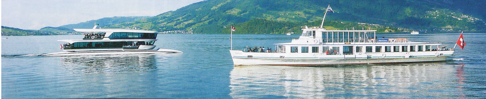
ABOVE: Historic meeting with 'ms Titlis' on the inaugural trip of the new catamaran.