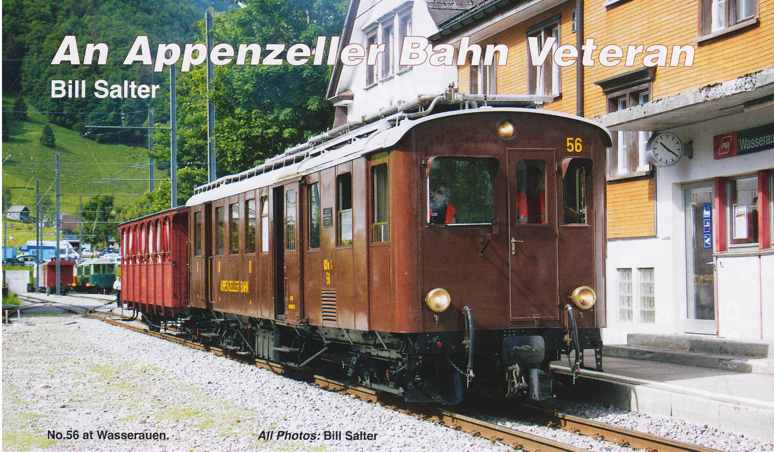
No.56 at Wasserauen.