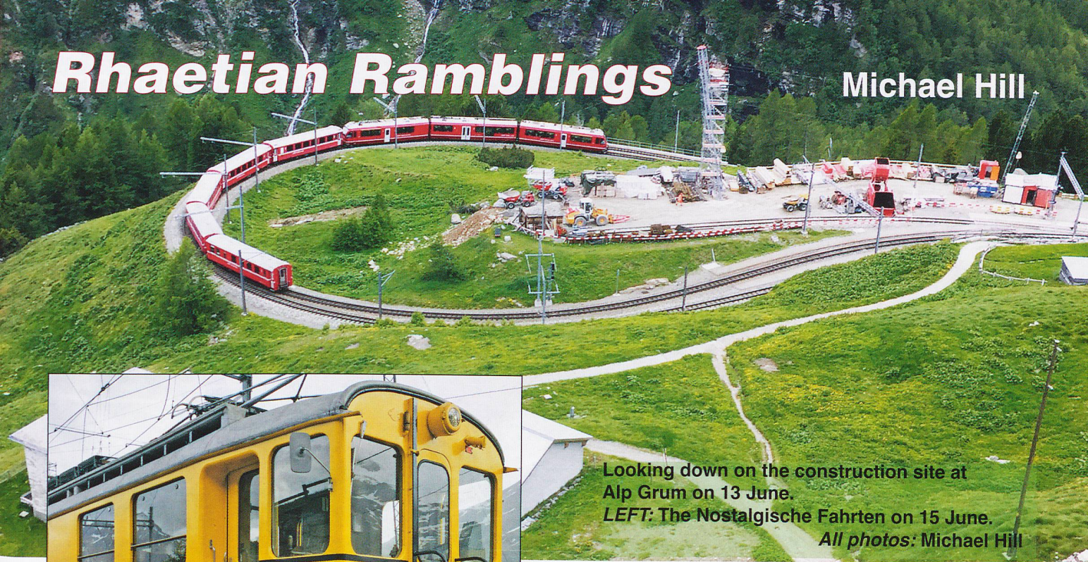
Looking down on the construction site at Alp Grüm on 13 June.