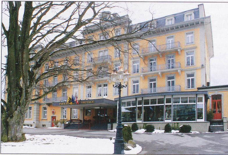
The Hotel du Sauvage, which was the Hotel Englischer hof in Conan Doyle's story, where Holmes and Watson stayed, earlier in the year of the fire.