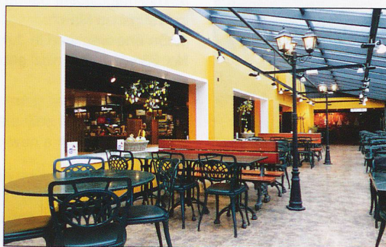
Inside the Coop at Bern.