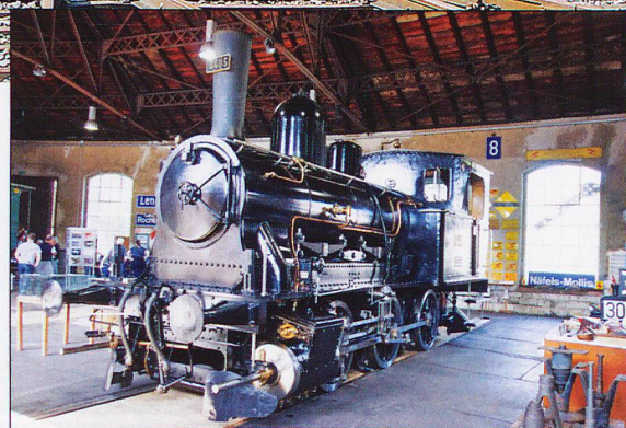
TOP: No.5819 in the Delémont depot. LEFT: No.5819 at Laufen. RIGHT: The villain of the piece, No.8485, sulking in Delémont shed.

We hear little of the Historische Eisenbahn Gesellschaft (HEG) - the Historical Railway Association of Switzerland. This is a pity as the HEG have existed since 1985, are very active, and are now part of SBB-Historic. Their purpose was always to rescue and restore historical rail equipment, and they had acquired a valuable collection of some twenty seven rolling stock items, mostly very old, kept at their main depot at the Roundhouse in Delémont, Canton Jura. They have restored several to running order and periodically run trains with these. Others are restored to original condition, or undergoing cosmetic restoration for preservation. Some years ago the collection was made over to SBB Historic in Brugg, but the working reality of the club remains, with on-going restoration of the valuable items in liaison with SBB Historic. The Delémont Roundhouse, a protected building, also contains many small treasures privately rescued from closed stations and along the lineside, which would grace many museums.